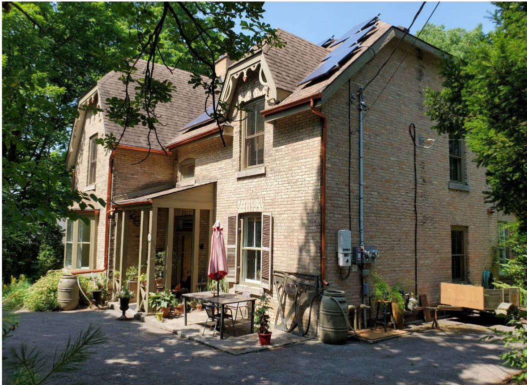
Mickle family photo of front of house (not dated)