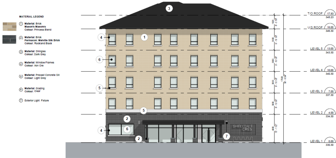
CONCEPT ELEVATION - NORTH 85 WILLOW RD, GUELPH