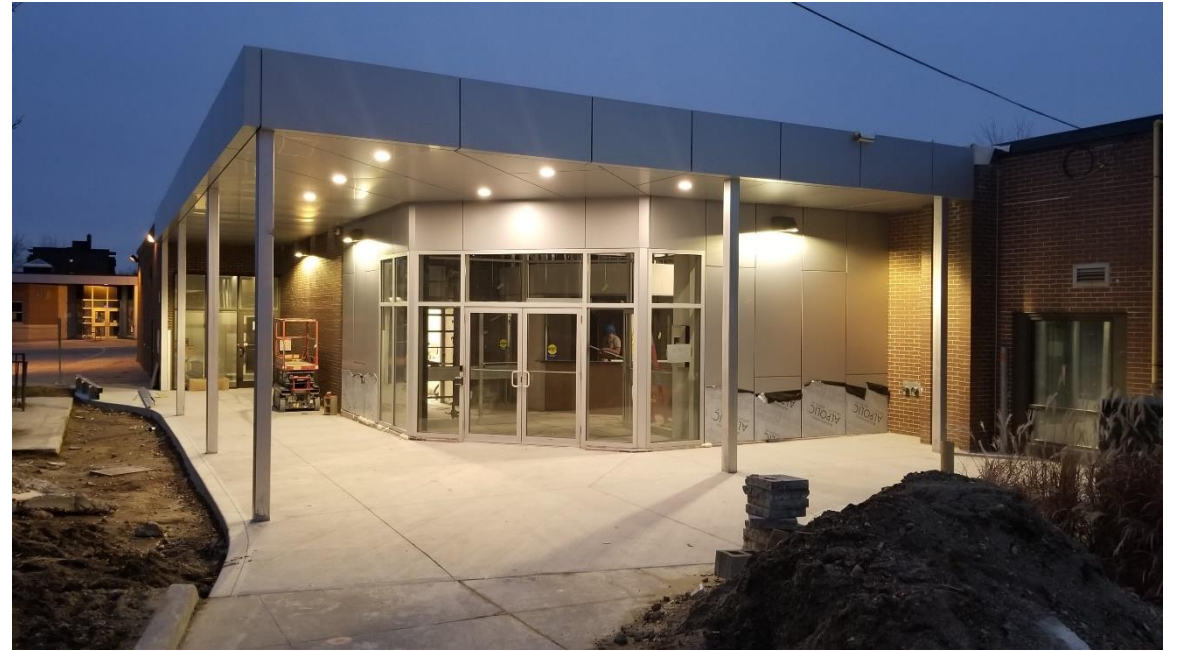
The Shelldale Centre – owned and operated by Kindle Communities (recently renovated)