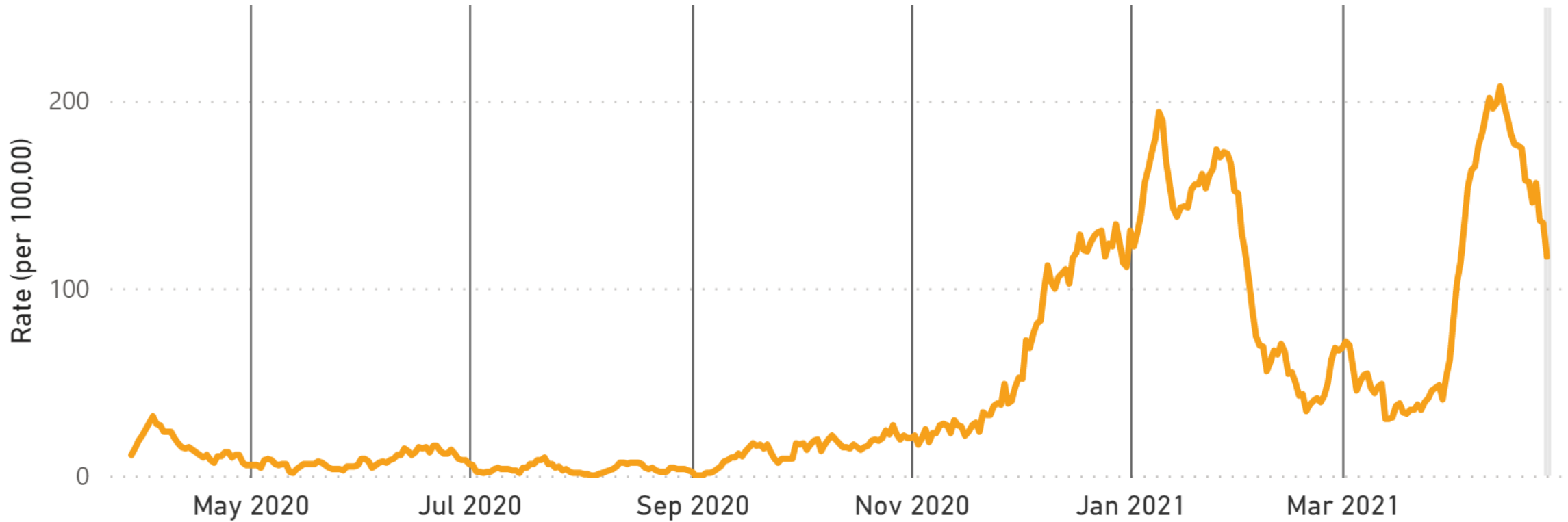
7-Day Moving Rate (per 100,000) by Reported Date, City of Guelph

Note: Illnesses beginning in the grey shaded area may not yet be reported.