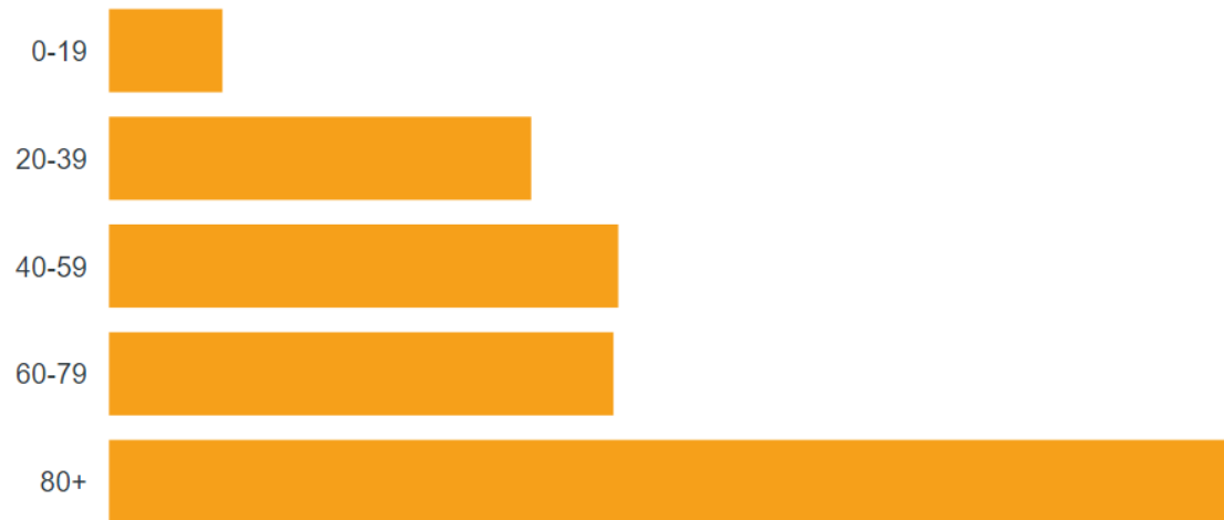
Rate of Confirmed Cases (per 100,000), by Age Group (WDG)

Includes dates - March 1, 2020 to August 31, 2020