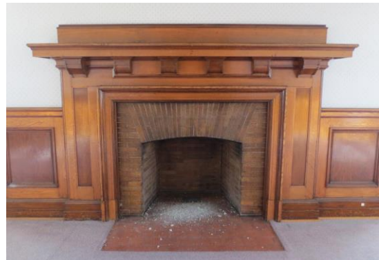
Administration Building: west fireplace; centre stairway; east fireplace