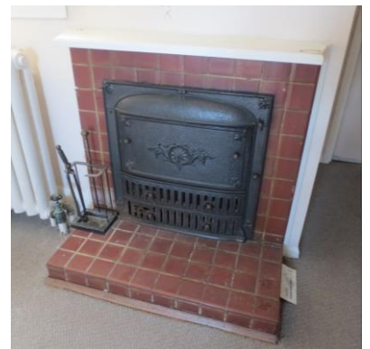
Superintendent's House: study fireplace; wood trim and ceiling in dining room; bedroom fireplace