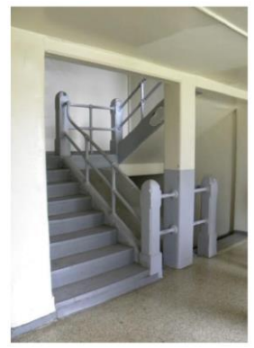
Main Detention Centre: C cells; B cells; large dining room; cell block stairs