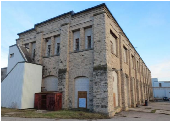
Machine Shop; Greenhouse