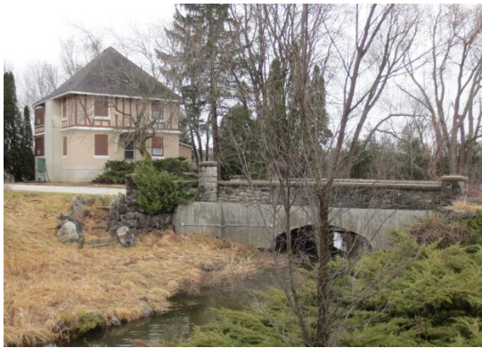
Willowbank Hall and main entrance bridge; Superintendent's House