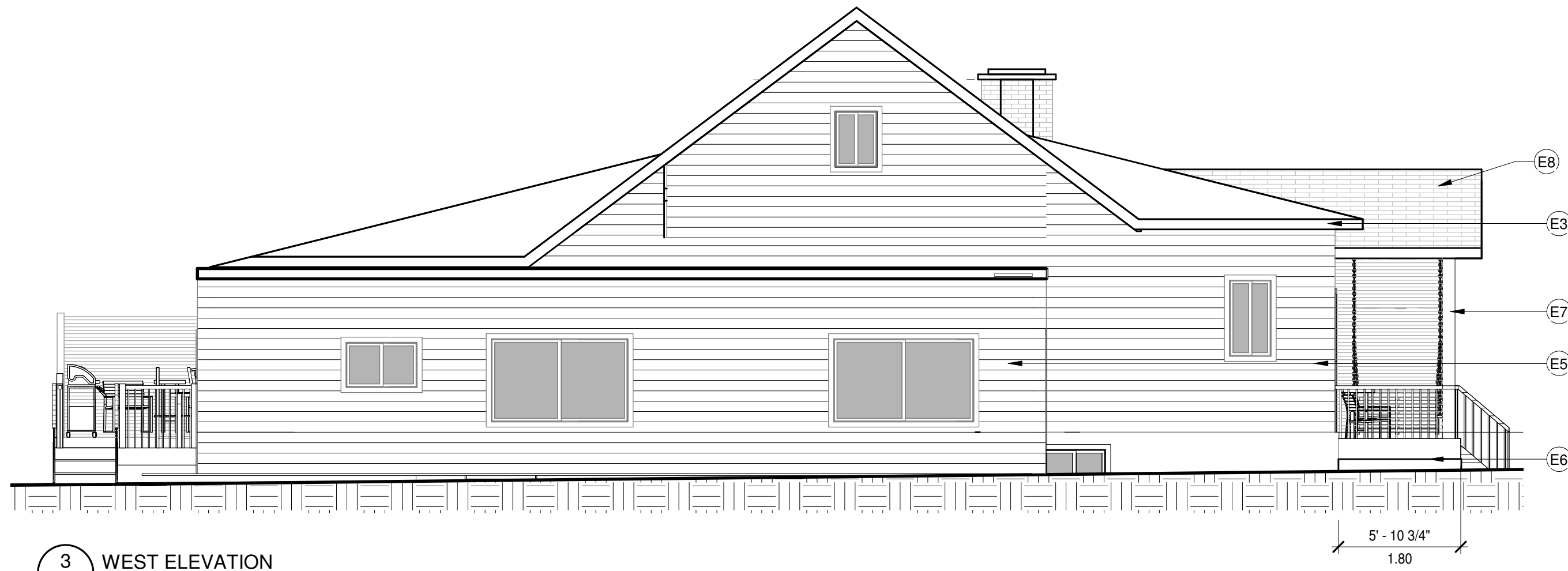
3 A6 WEST ELEVATION 3/16" = 1'-0"