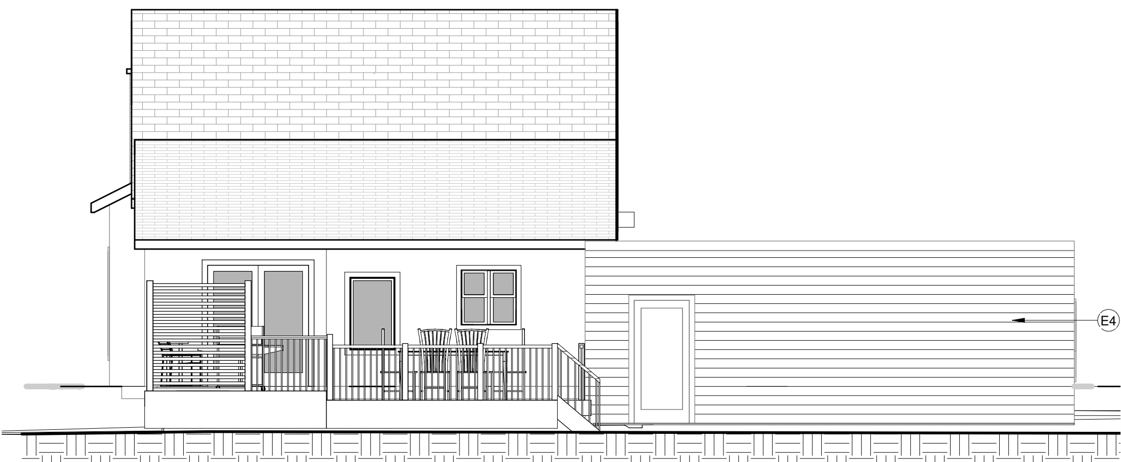
4 A6 NORTH ELEVATION 3/16" = 1'-0"