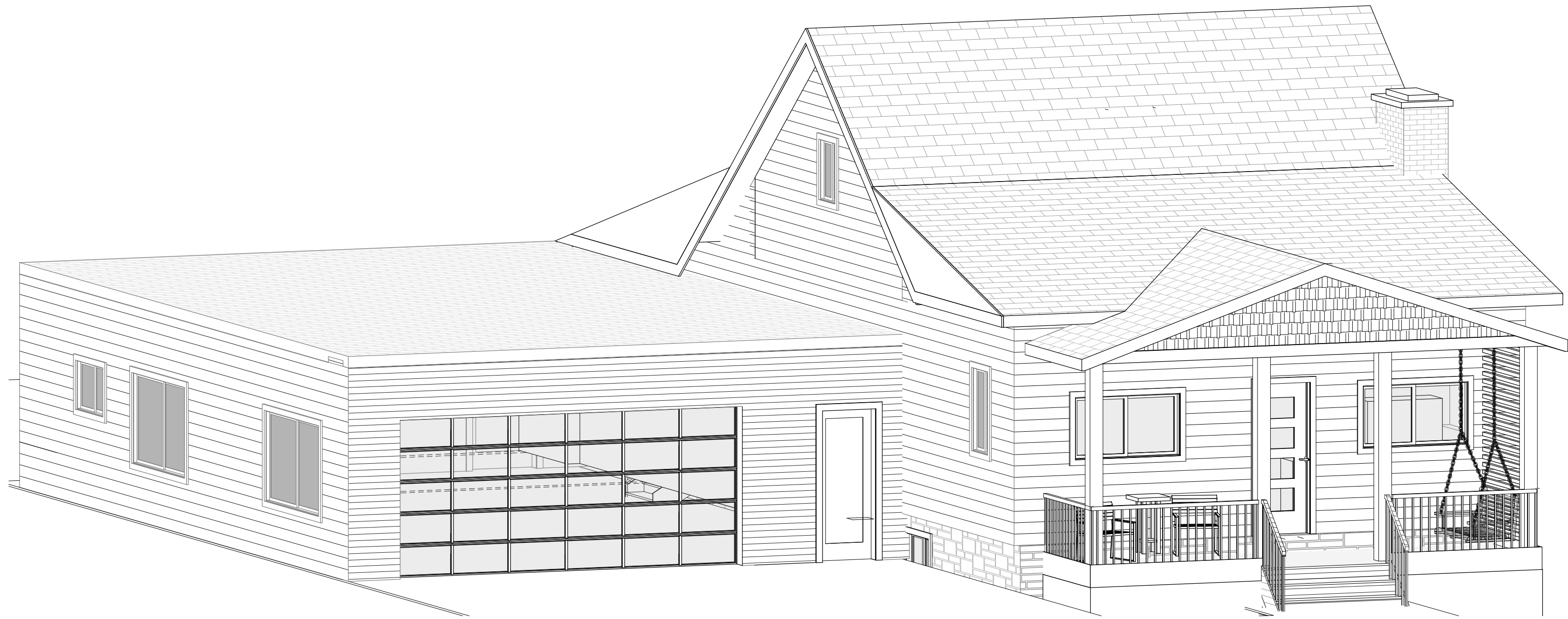
1 A6 EXTERIOR PERSPECTIVE