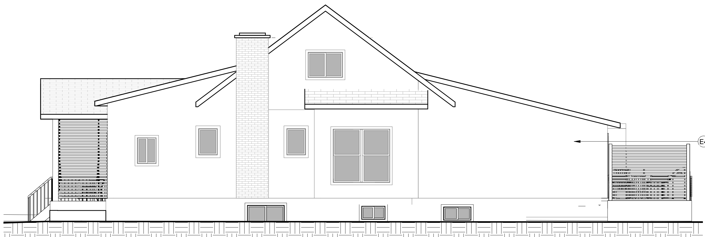
5 A6 EAST ELEVATION 3/16" = 1'-0"