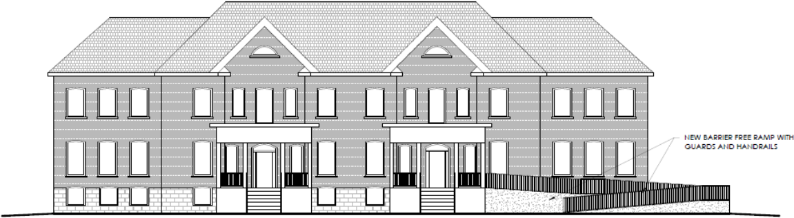
SOUTH ELEVATION 1 2 5m