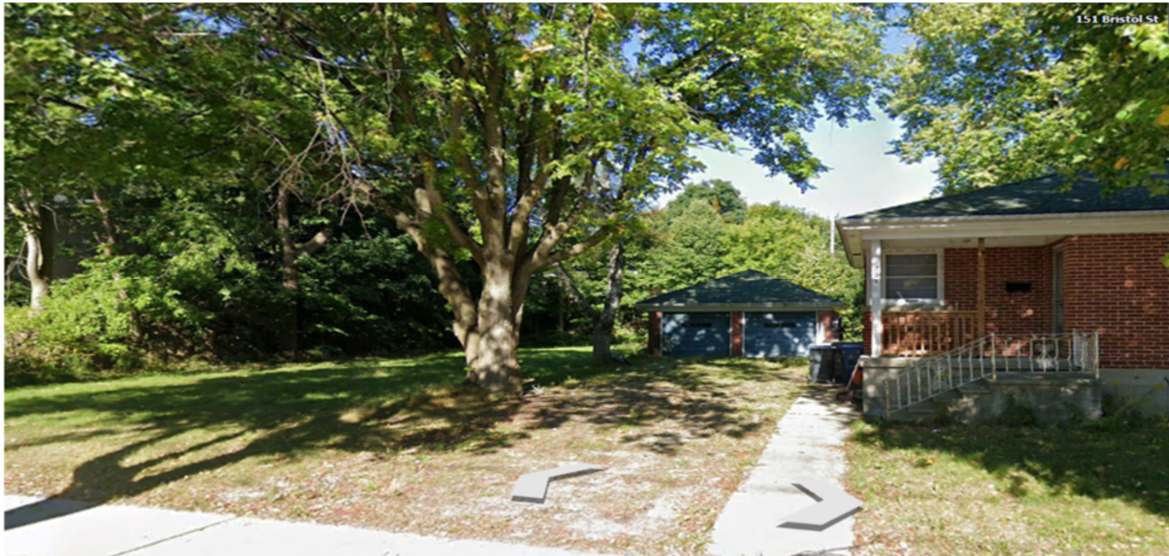
Exhibit 1 Site before Tree Removal