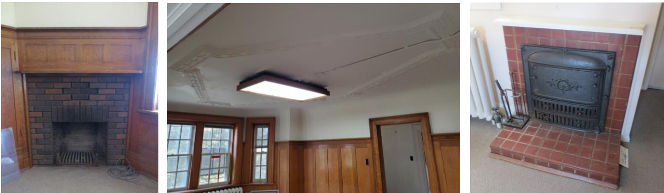
Superintendent's House: study fireplace; wood trim and ceiling in dining room; bedroom fireplace