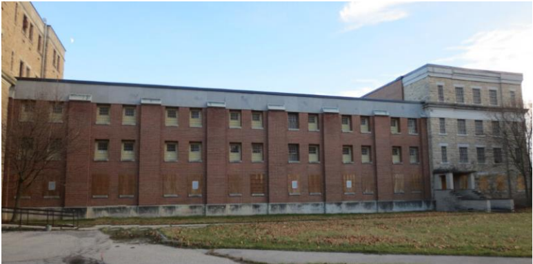
Tower; B Cells and T Dormitory