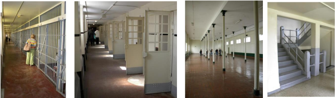
Main Detention Centre: C cells; B cells; large dining room; cell block stairs