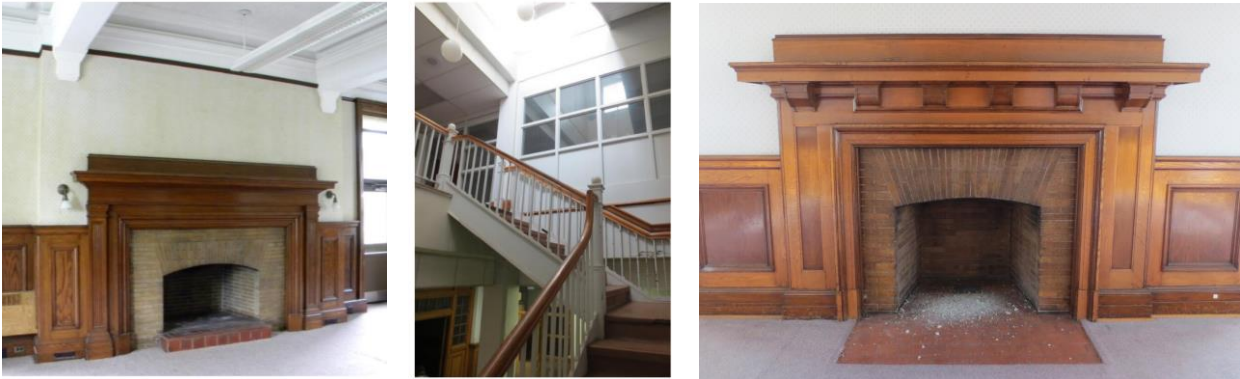
Administration Building: west fireplace; centre stairway; east fireplace