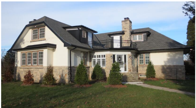
Willowbank Hall and main entrance bridge; Superintendent's House