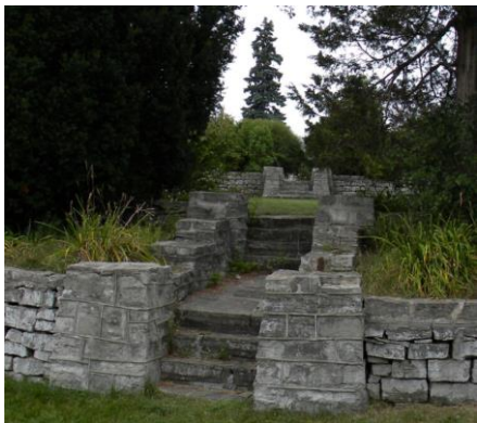
Sentinel stones at small pond with large pond in background; stone field wall with sentinel stone; concrete bridge in driveway over stream; tree-lined driveway with stone field wall; terraced walls and steps around Superintendent’s House.