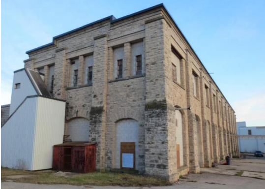
Machine Shop; Greenhouse