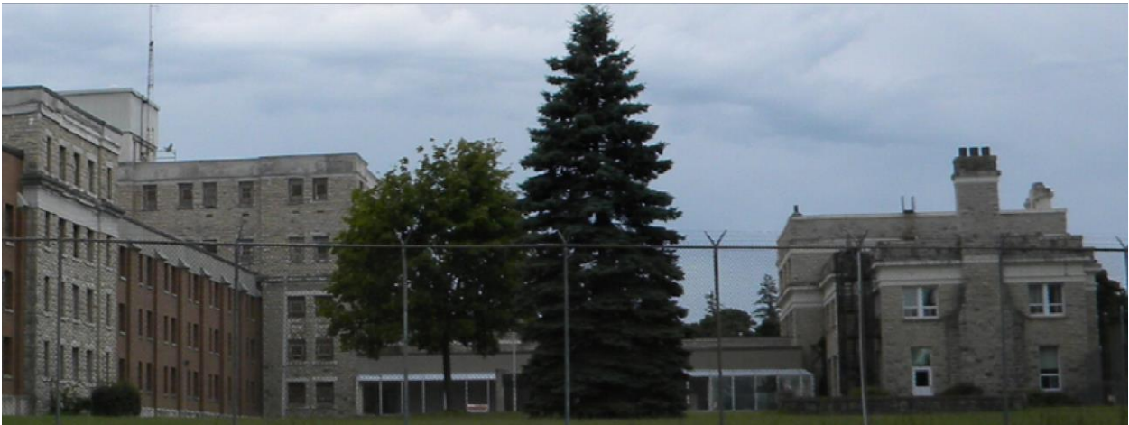
C dormitory and C cells; tower and main corridor; Administration Building