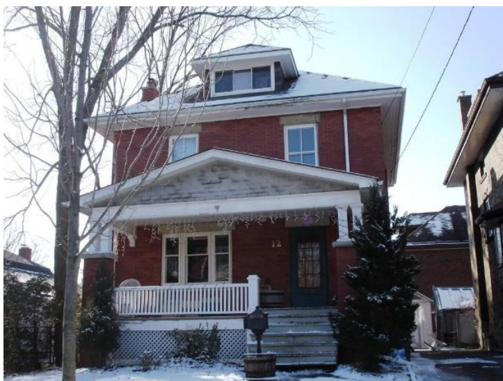
12 Central St