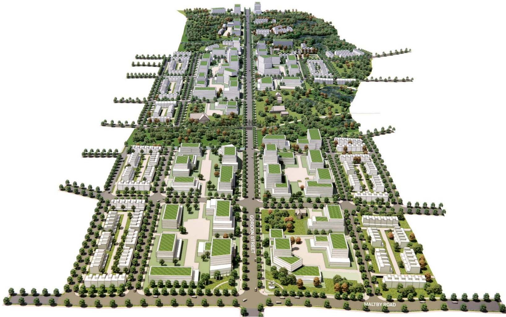
Image Description: The image displays a conceptual rendering of the Gordon Street corridor looking north from Maltby Road. It depicts a mix of building types (apartments, townhouses) in the developable areas of the Clair-Maltby Secondary Plan. The protected Natural Heritage System is also depicted. It shows vehicular and active transportation corridors with tree planting. The corridor extends to Poppy Drive.