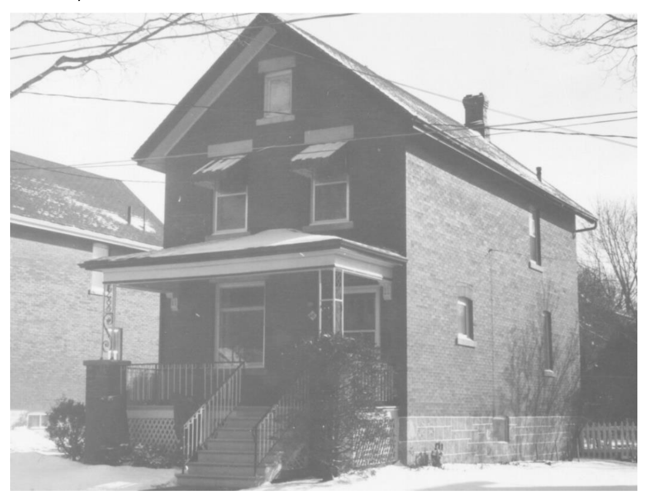
48 Tiffany St W