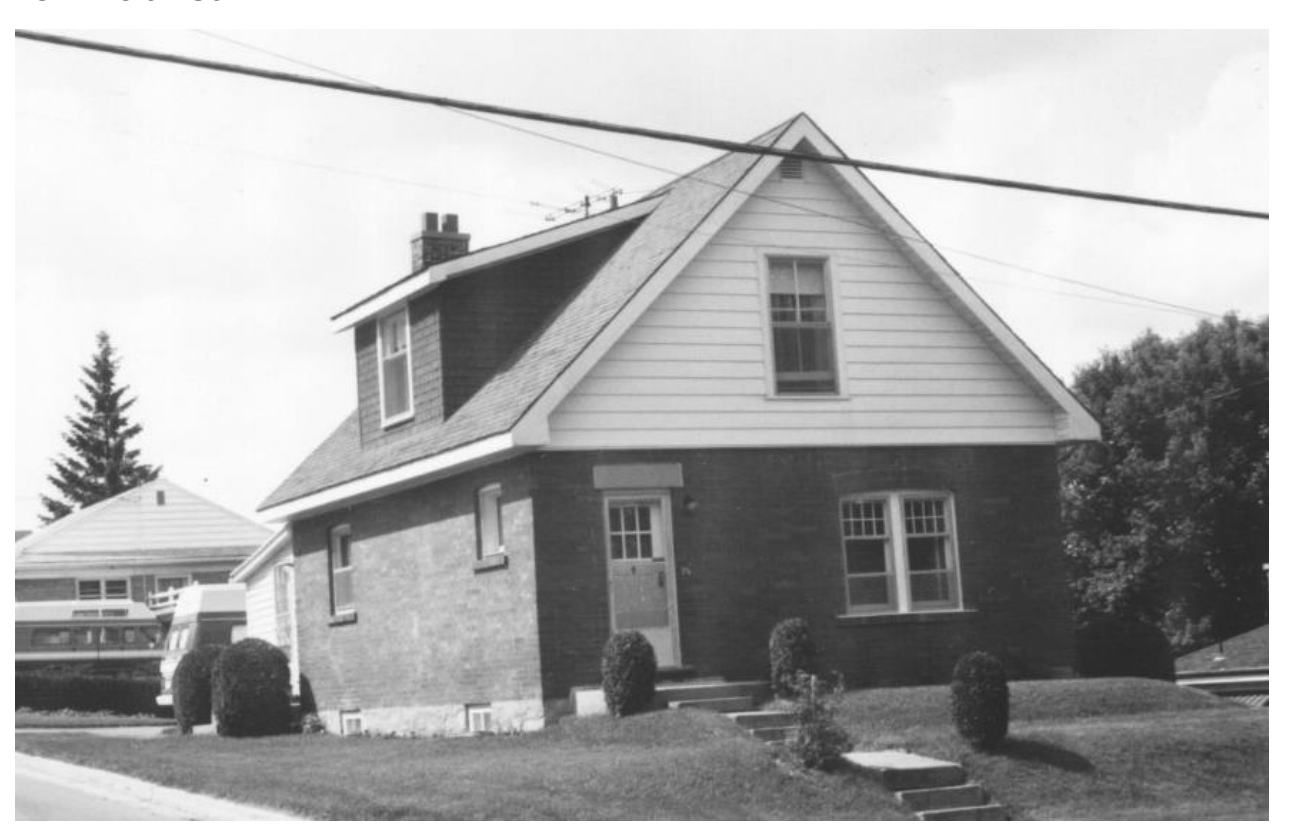
75 Division St