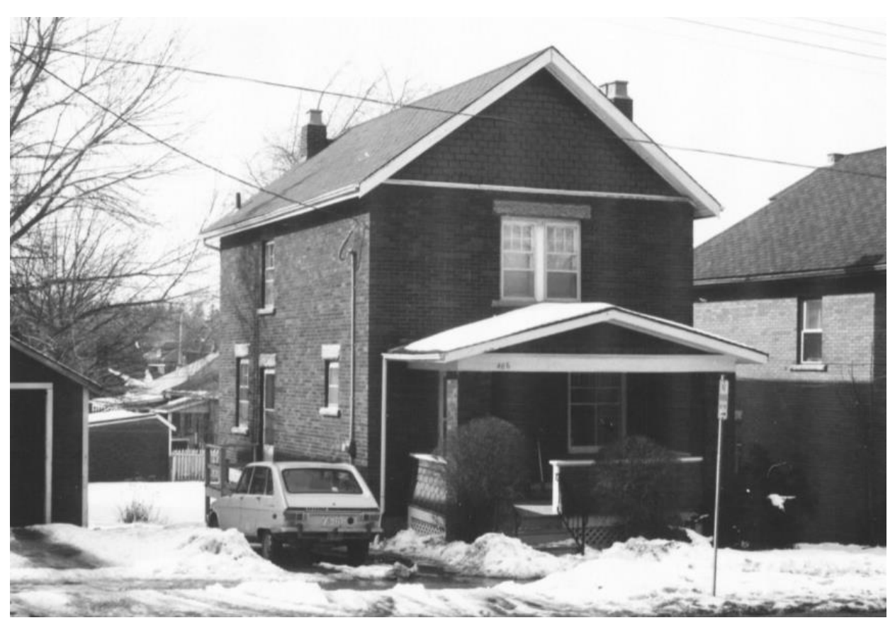
486 Woolwich St