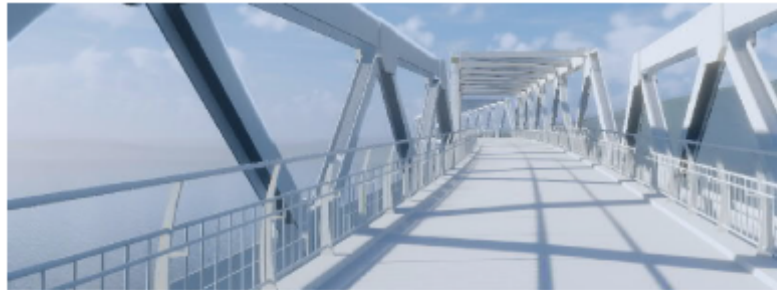
Edmonton to Strathcona County Footbridge

With its remaining funds from the Phase I Capital program, the RVA has two infrastructure projects underway through 2021-22