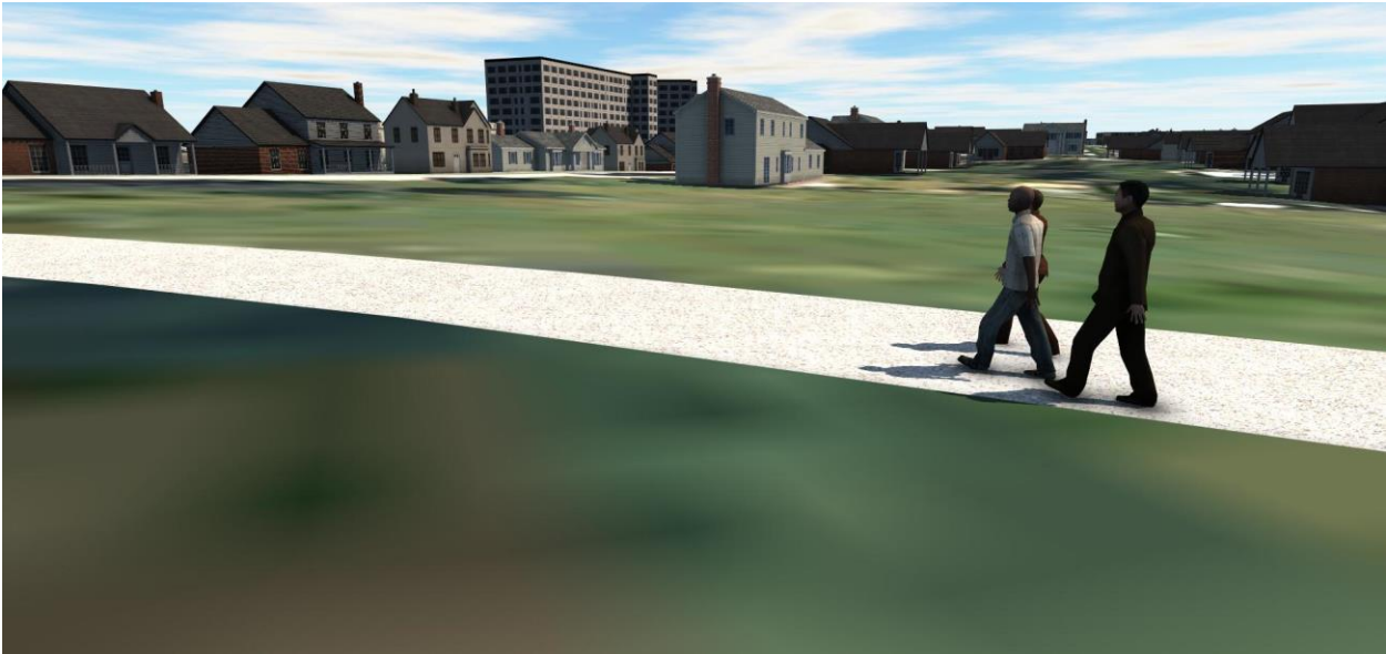
Figure 5 – View from Hickory Street, Adjacent to Oak Street Park