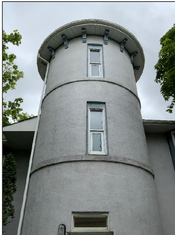
Photograph 1: Exterior parge coat (typical)

The exterior masonry appears to be in fair condition globally. There are no major step-cracks or other signs of structurally significant settlement or deflection that would indicate that the primary structure is not performing as required. However, it should be noted that the application of the cementitious parging coat has resulted in a non-reversible change to the masonry.