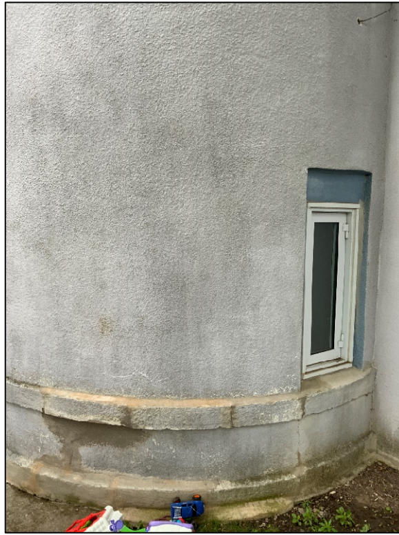
Photograph 2: Deteriorating parge coat (typical)

banding, in that the stone cannot be exposed without significant damage to the original masonry.