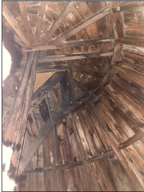
Photograph 3: Roof framing (from hatch)

Water staining is visible on many roof framing members. The stair visible in the photograph above leads to a roof hatch to the flat section at the top of the tower. It is not possible to comment on the condition of these members with the access available at the time of the review.