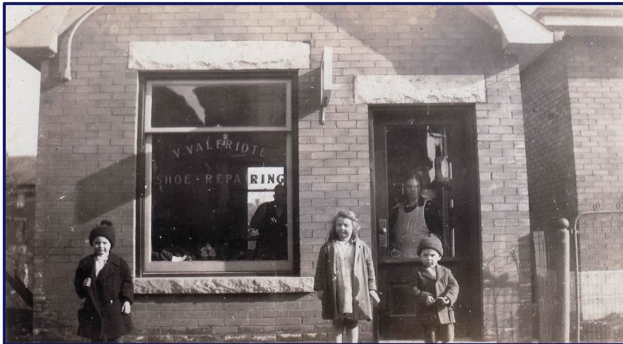
c. 1928.