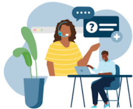
Investment in digital and customer service