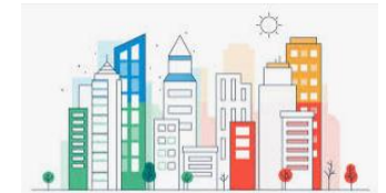
Capital program resourcing