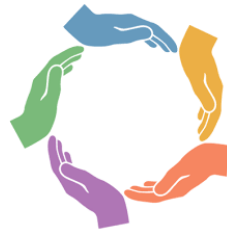
Community benefit agreement expansion