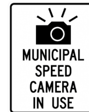
Emerging transportation technology