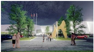
South end community centre phase- in