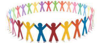
Maintain service level to our growing community