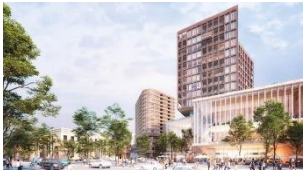
Baker district phase-in