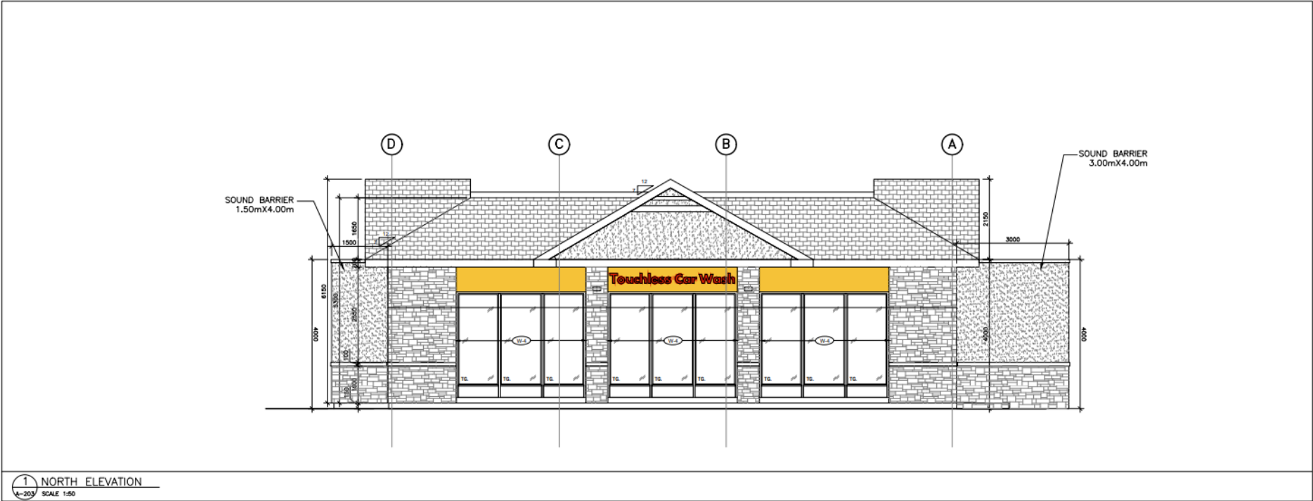
Figure 1: North Elevation