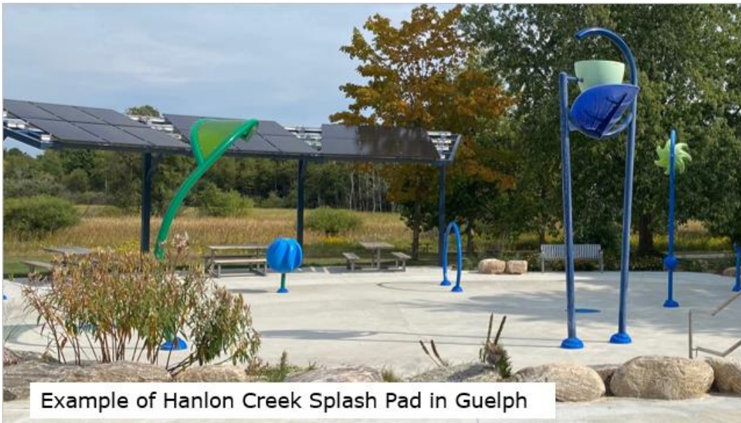
Example of Hanlon Creek Splash Pad in Guelph

Federal and provincial standards will be met in addition to the AODA and FADM requirements.