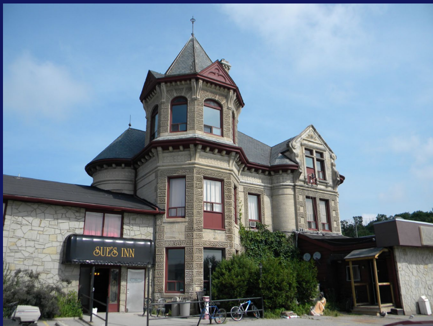
Heritage Planning Staff, 2010.