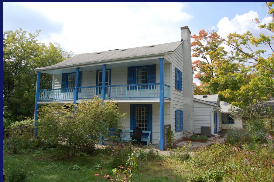
Heritage Planning Staff, 2015.