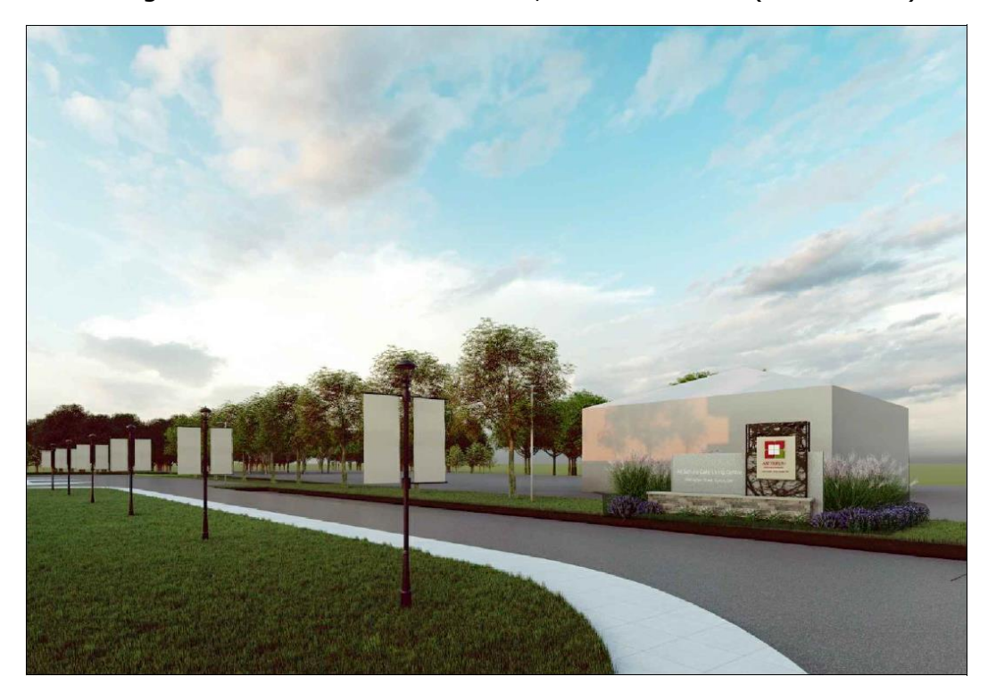
Rendering 4: View of Gordon Street, main entrance (from north)