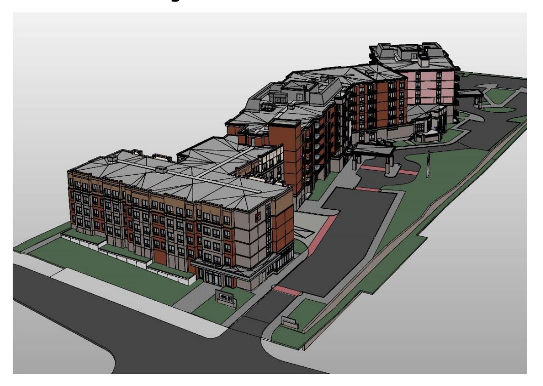
Rendering 5: Aerial View (looking southeast)