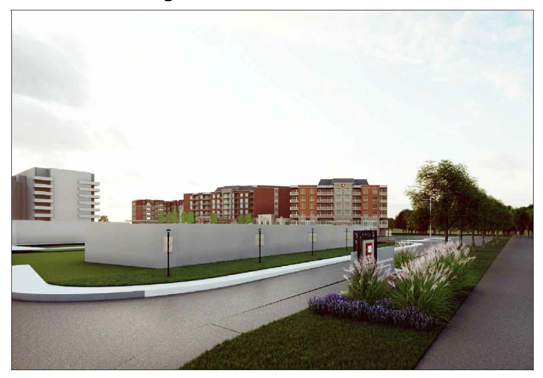
Rendering 3: View from Gordon Street, main entrance (from south)