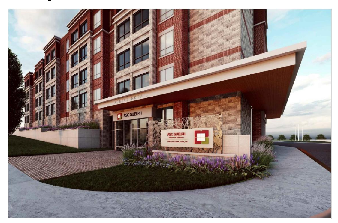
Rendering 2: Arkell Road commercial unit