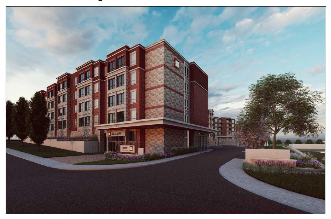
Rendering 1: View from Arkell Road entrance