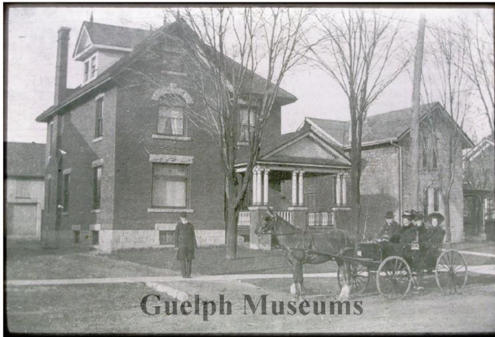
Figure 6 - Tanner home on Oxford St, c. 1915