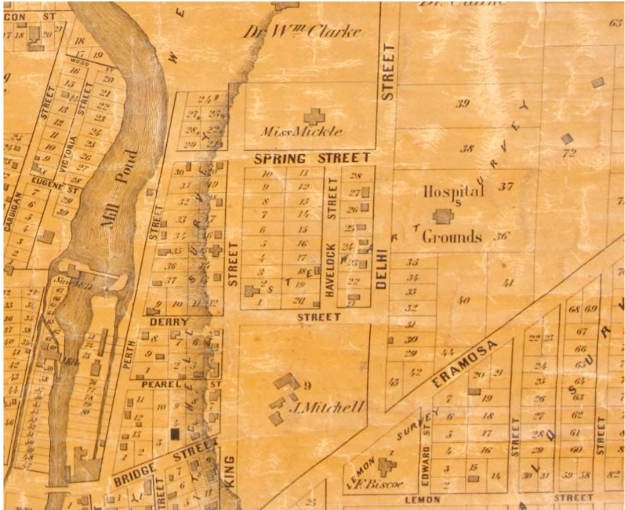
Figure 1 - Detail from Cooper's Map the Town of Guelph, 1875 showing hospital and "Hospital Grounds" within the Stewart Survey. (Image: Guelph Civic Museum).