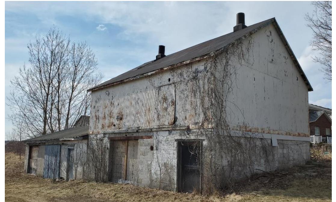
Heritage Planning Staff, 2022