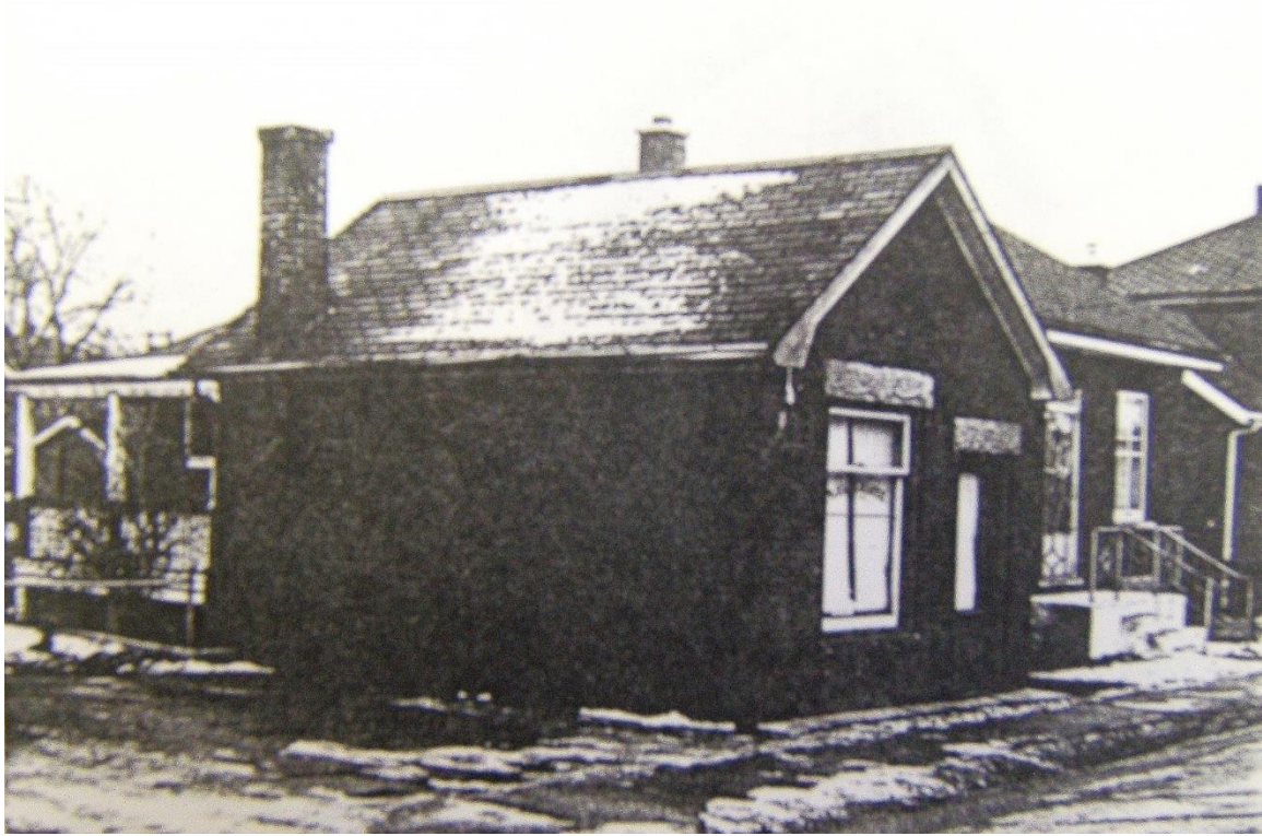
Figure 11 – Photo of shoe shop on 47 Alice Street, ca. 1975 (Gordon Couling 1975)