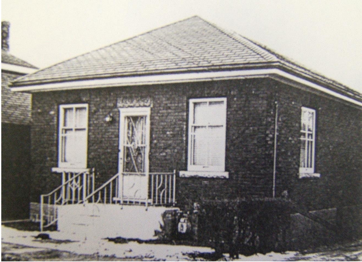
Figure 10 – Photo of residence on 47 Alice Street, ca. 1975 (Gordon Couling 1975)