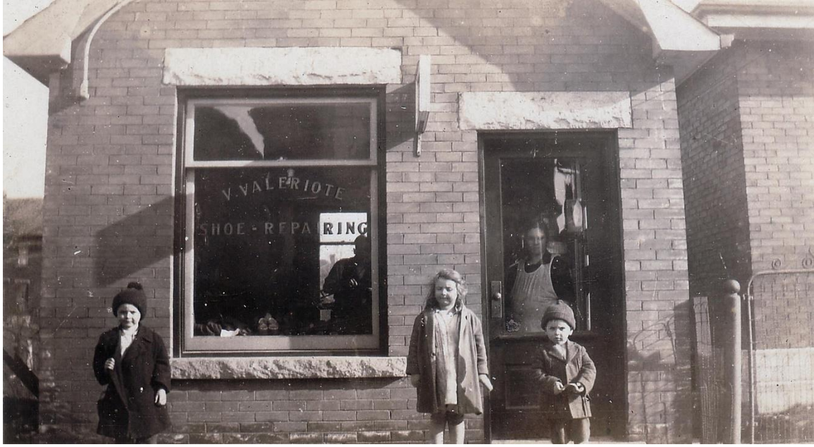
Figure 5 – Black and white photo of 47 Alice Street in the 1920s (Gayle Valeriote)