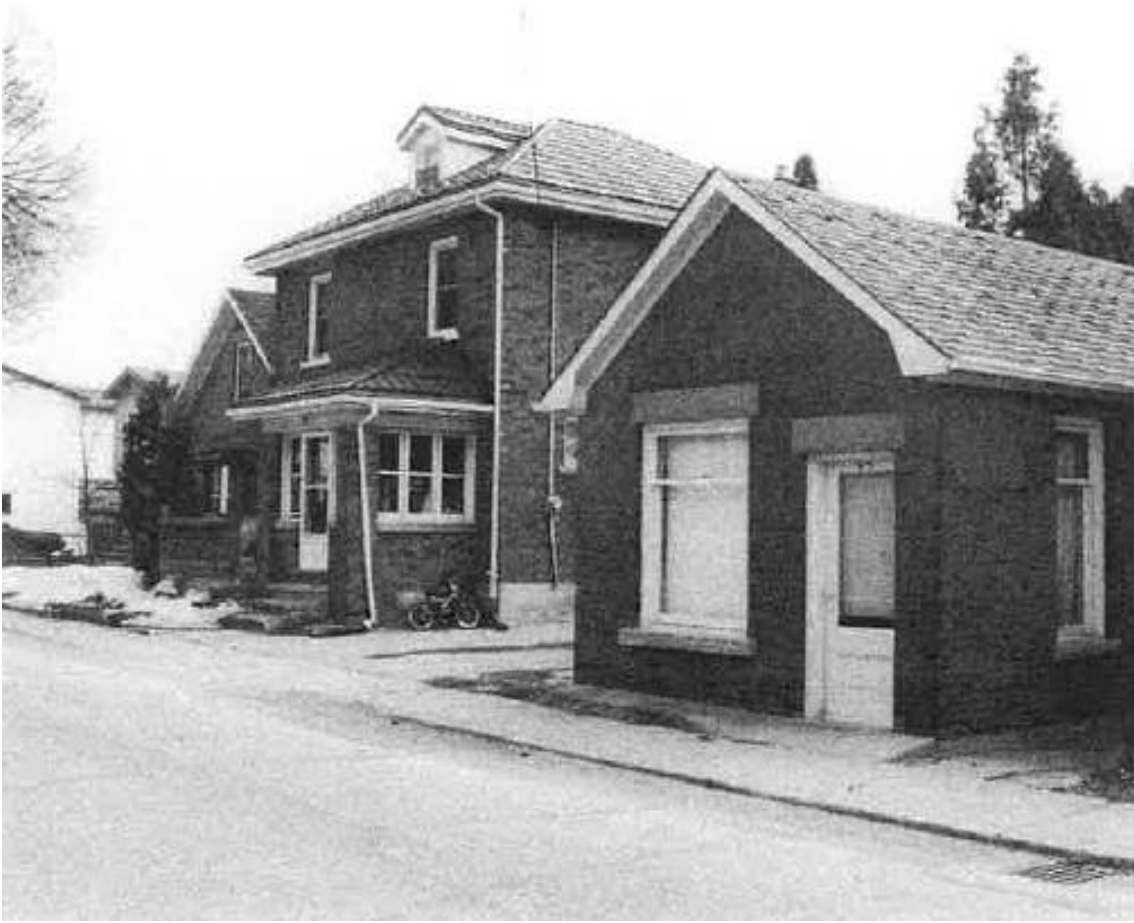
Figure 9: Photo of shoe shop on 47 Alice Street, ca. 1950s (Valeriotte 2010)