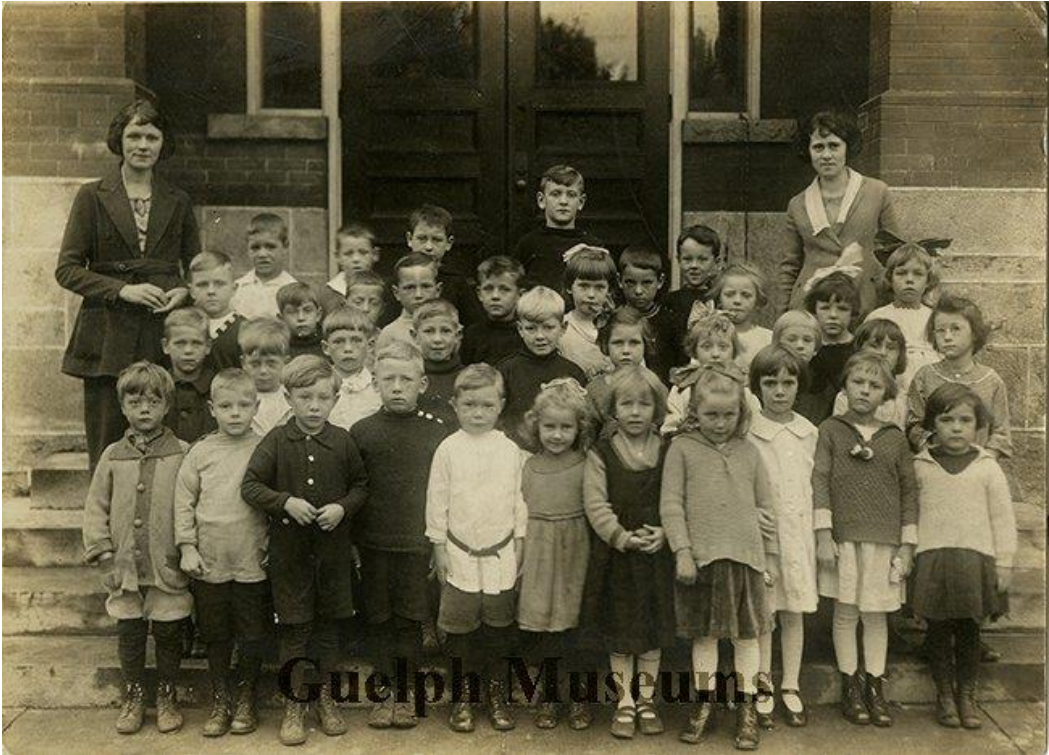
Figure 8 - Students at Tytler, c. 1925. Guelph Civic Museum, 1990.7.2