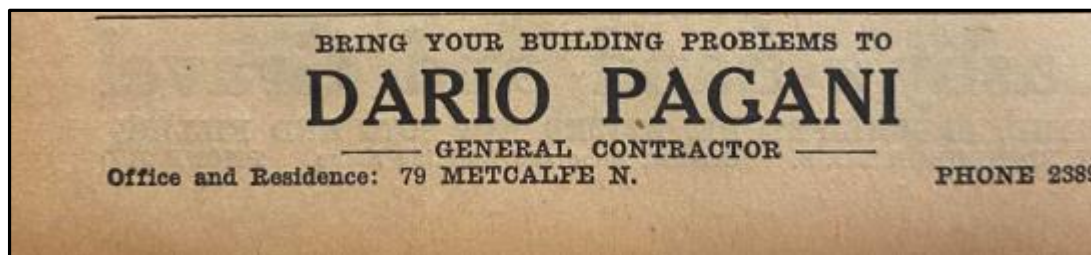
Figure 5: Detail from 1938 City of Guelph Directory listing 79 Metcalfe as Pagani's "Office and Residence"

build modern houses. Cast-in-place concrete was a rarity in 1930s Ontario residential construction.