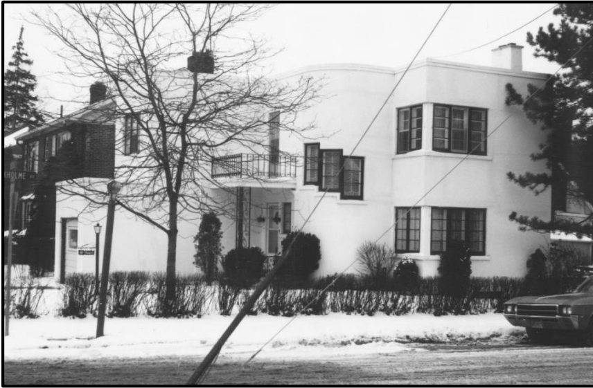
Figure 1: Dario Pagani House in January 1975 from the Couling Building Inventory

metal balustrade. A drive-in garage protrudes from the northwest façade of the structure.