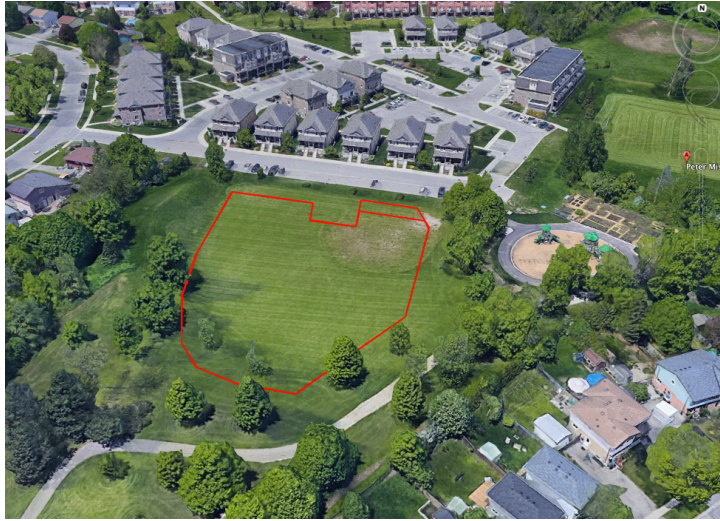
Peter Misersky Park (0.75 acres)

7am it starts , multiple dogs barking, owner voices, car-doors, vehicle security and gate slamming and continues well after dusk sometimes after midnight; worse on weekends because dog-owners are not working. – Close to 40 households directly impacted.