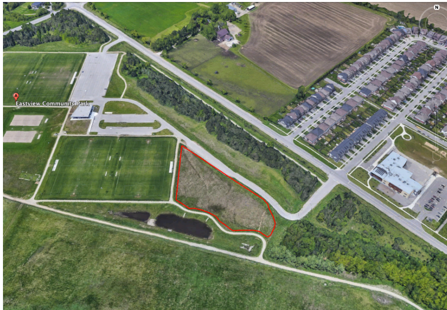
Eastview (2.27 acres)

A considerable number of dog-owners utilize Eastview on a daily basis for their dog recreation – trails and open spaces. Majority of these dog-owners drive to Eastview .