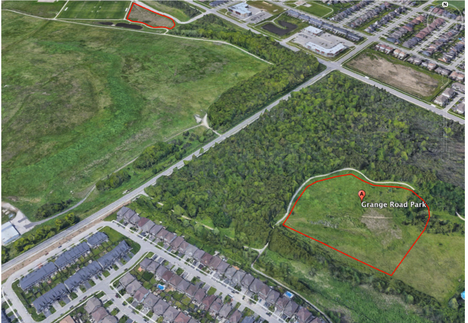
Grange Road (5.67 acres)