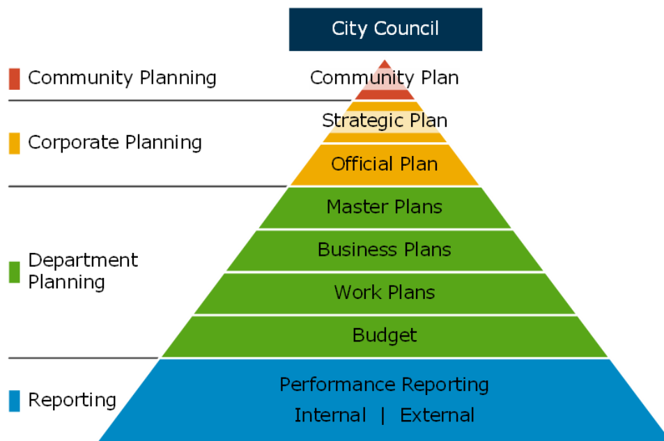
Figure 1. City of Guelph’s Strategic Alignment Diagram.