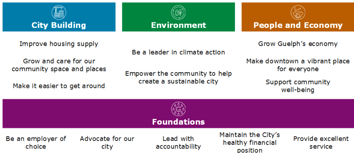
Figure 2. Future Guelph – Overview of the Strategy.

For the development of Future Guelph, staff used a simplified approach to organize the Plan, focused on using clear language and making the objectives and initiatives easy to understand. For the City’s vision, mission and values, a survey was conducted with staff to reconfirm its relevance. Based on the results, it was determined that the City’s current vision, mission and values were still relevant and would remain the same for Future Guelph.