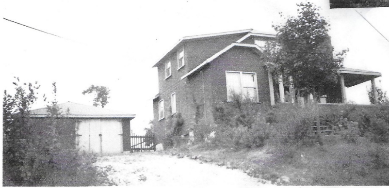
A view from the back yard showing the back of the house.