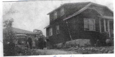
The finished product a couple years later. ←

338 Kitchell St. Memphis Had built the house and garage in 1939. It was our home from 1939-49 We moved in to it in the fall 1939. before it was finished ORL the inside.