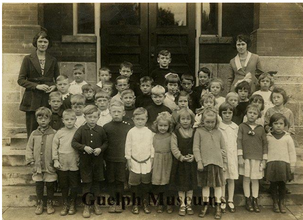
Figure 8 - Students at Tytler, c. 1925. Guelph Civic Museum, 1990.7.2