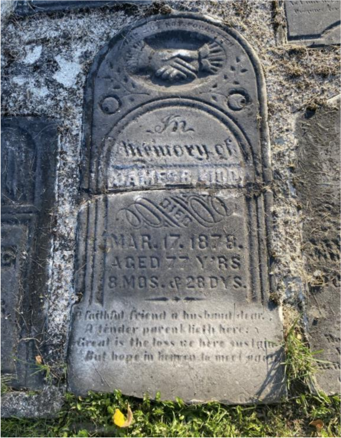
Figure 13 - James Kidd's Grave at Arkell Methodist Church Cemetery.