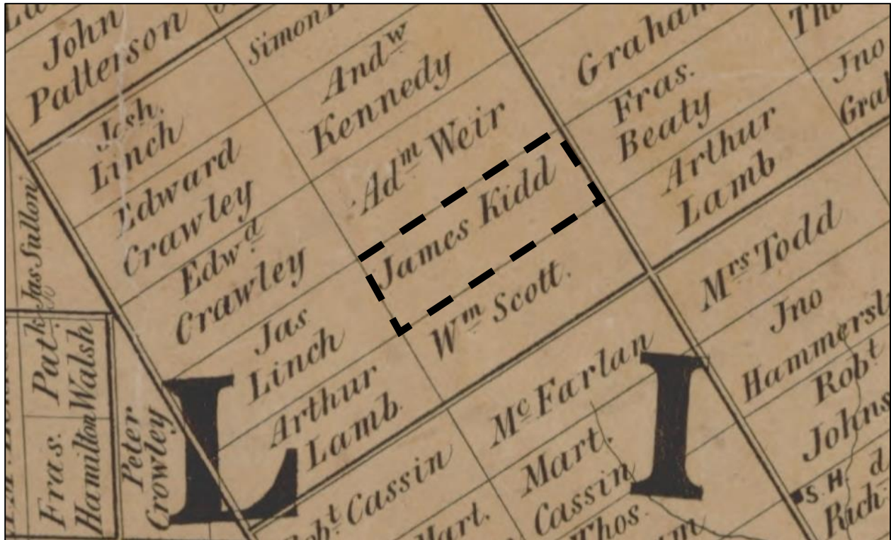
Figure 1: Detail of lot fabric in Township of Puslinch from Leslie and Wheelock's 1861 Map of the County of Wellington. Lot 14 in Concession 7 owned by James Kidd (indicated with dashed outline).