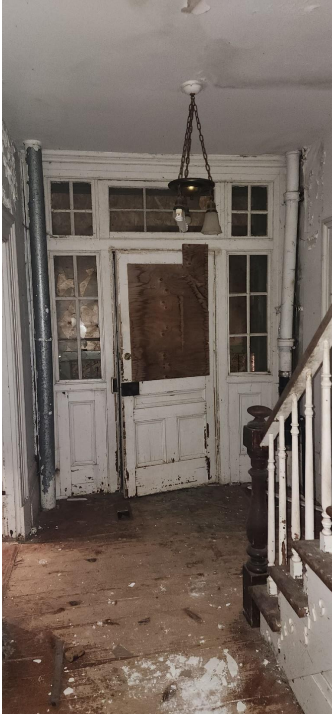
Figure 1: Front Entrance