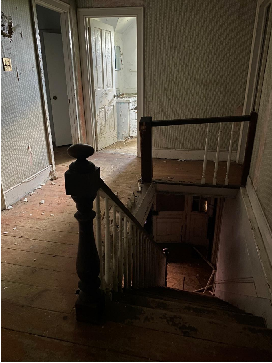
Figure 11: Upper floor looking downstairs