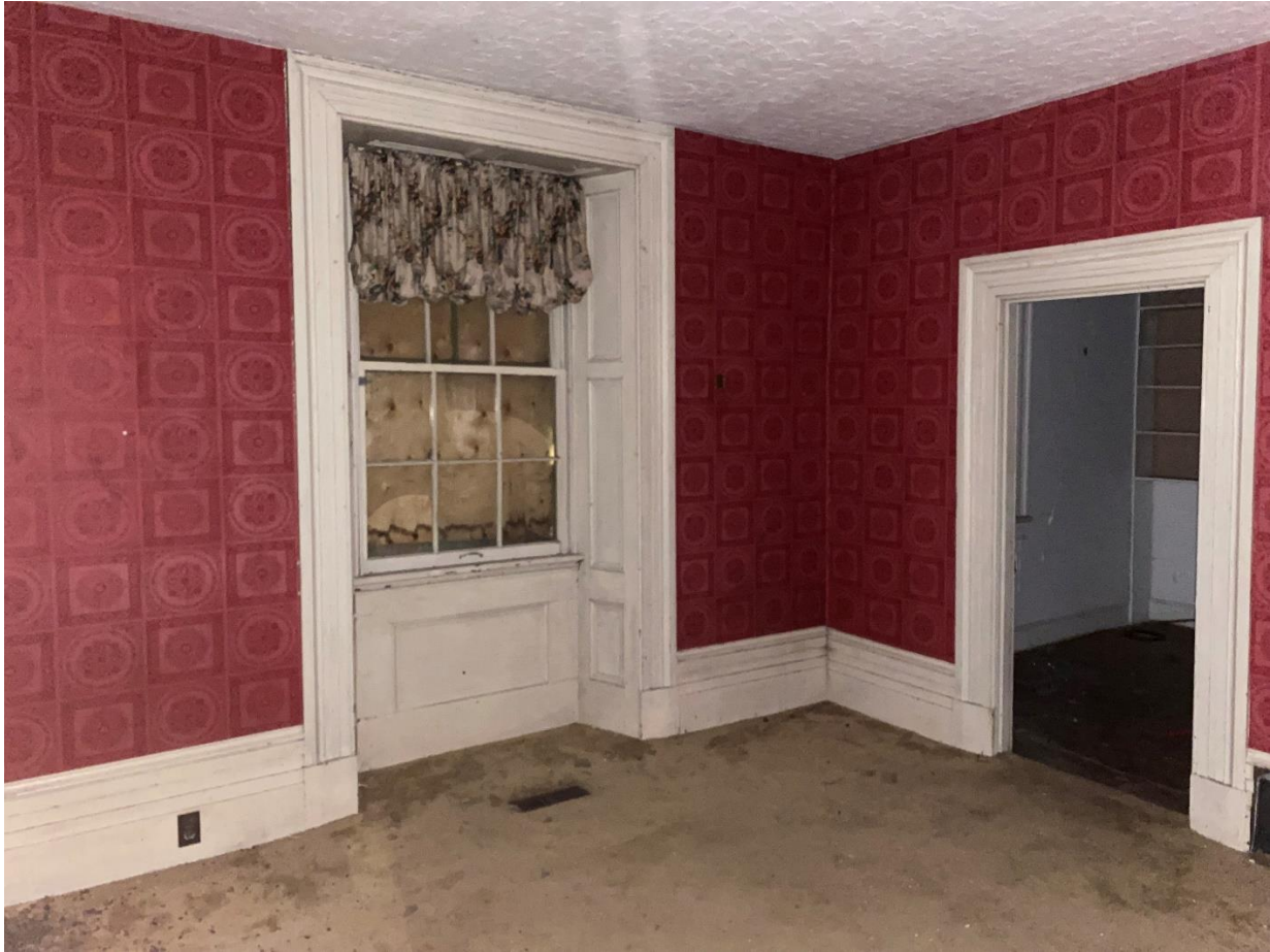
Figure 4: Parlour