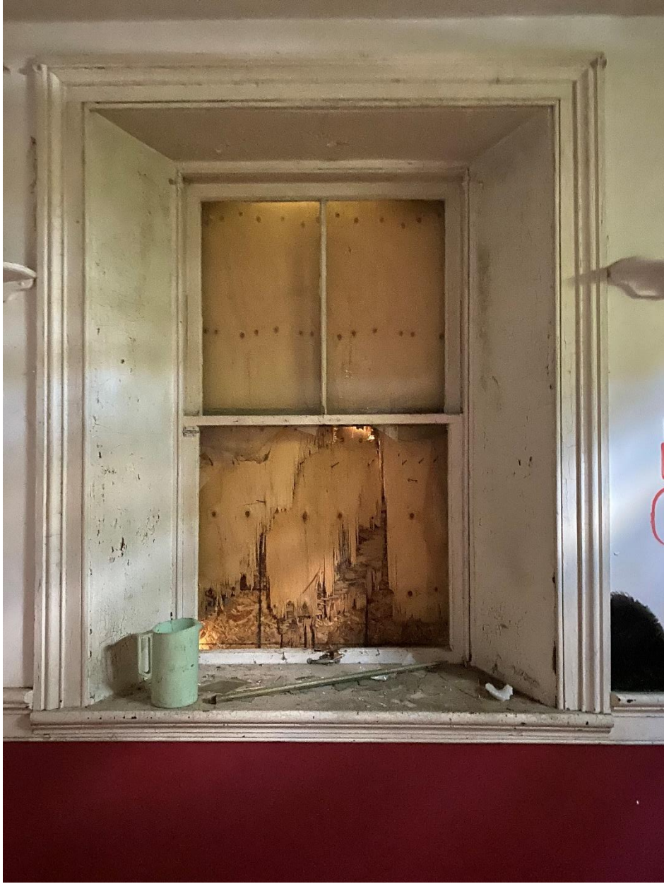
Figure 7: Destroyed window in dining room