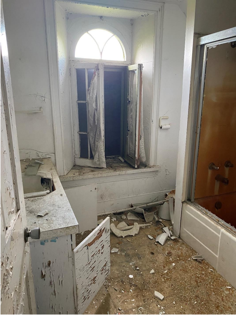
Figure 14: Upper floor bathroom