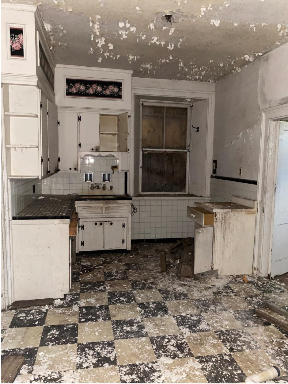
Figure 9: Kitchen