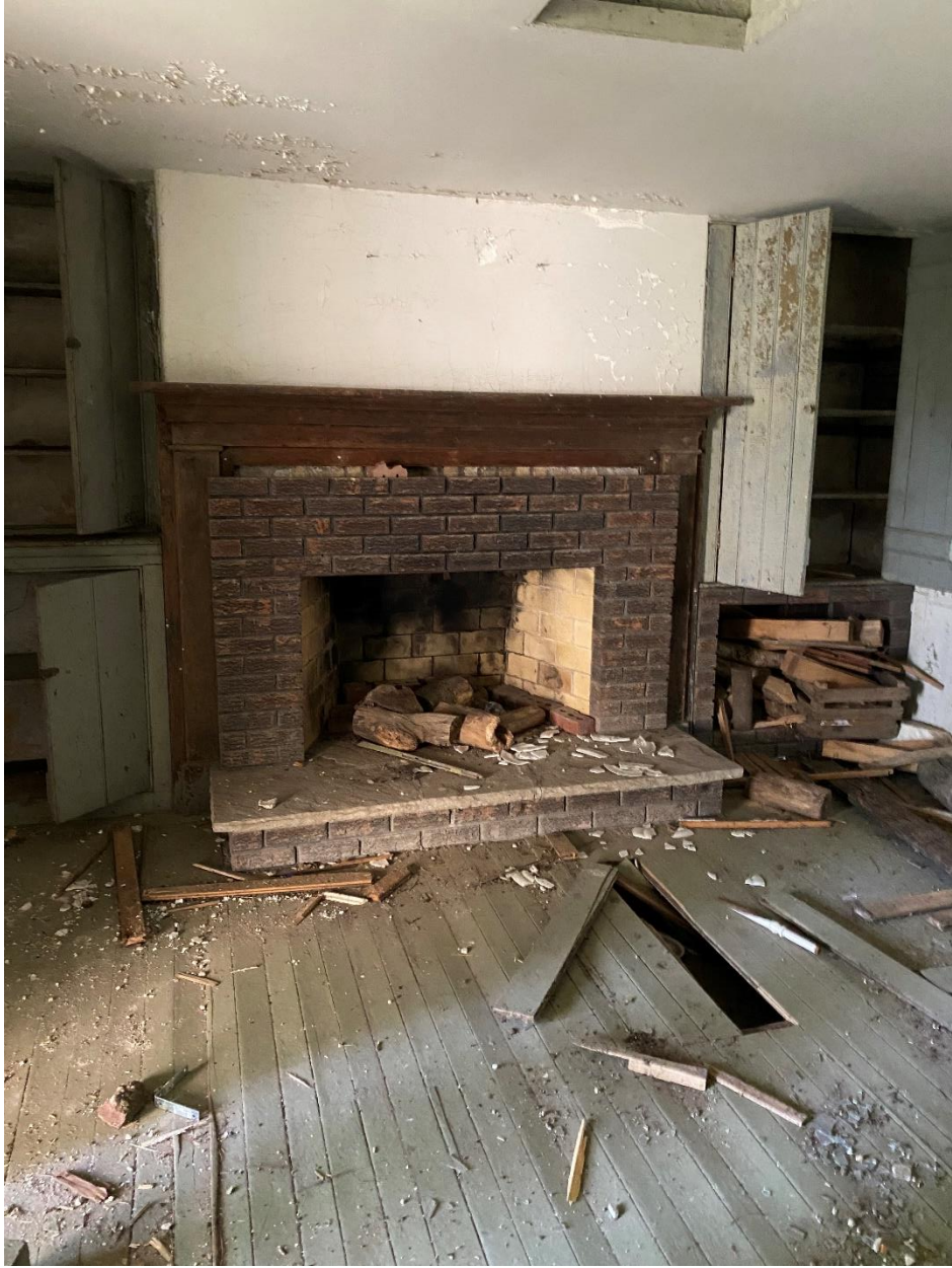
Figure 10: Summer kitchen