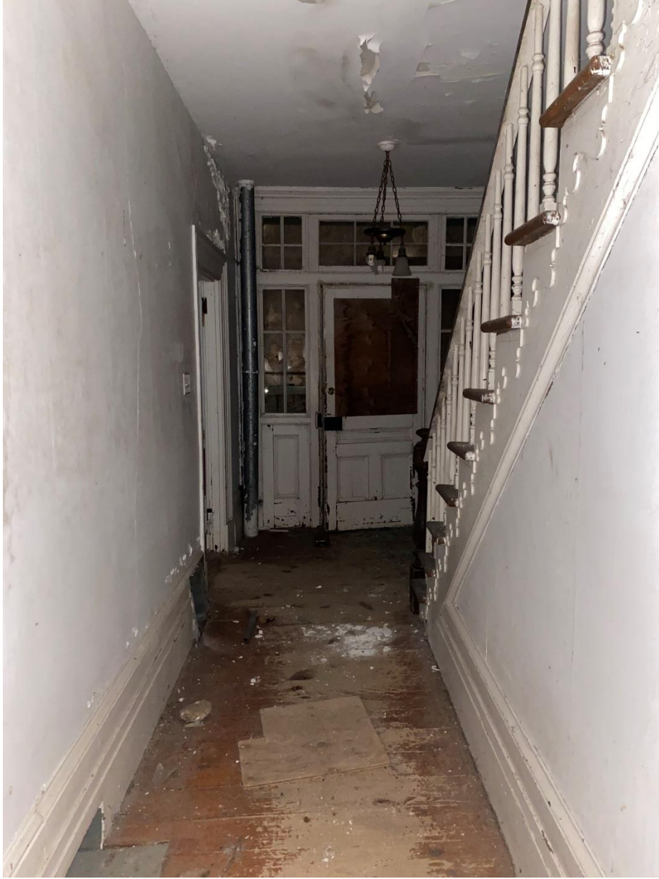
Figure 8: Front hallway viewed from back of house