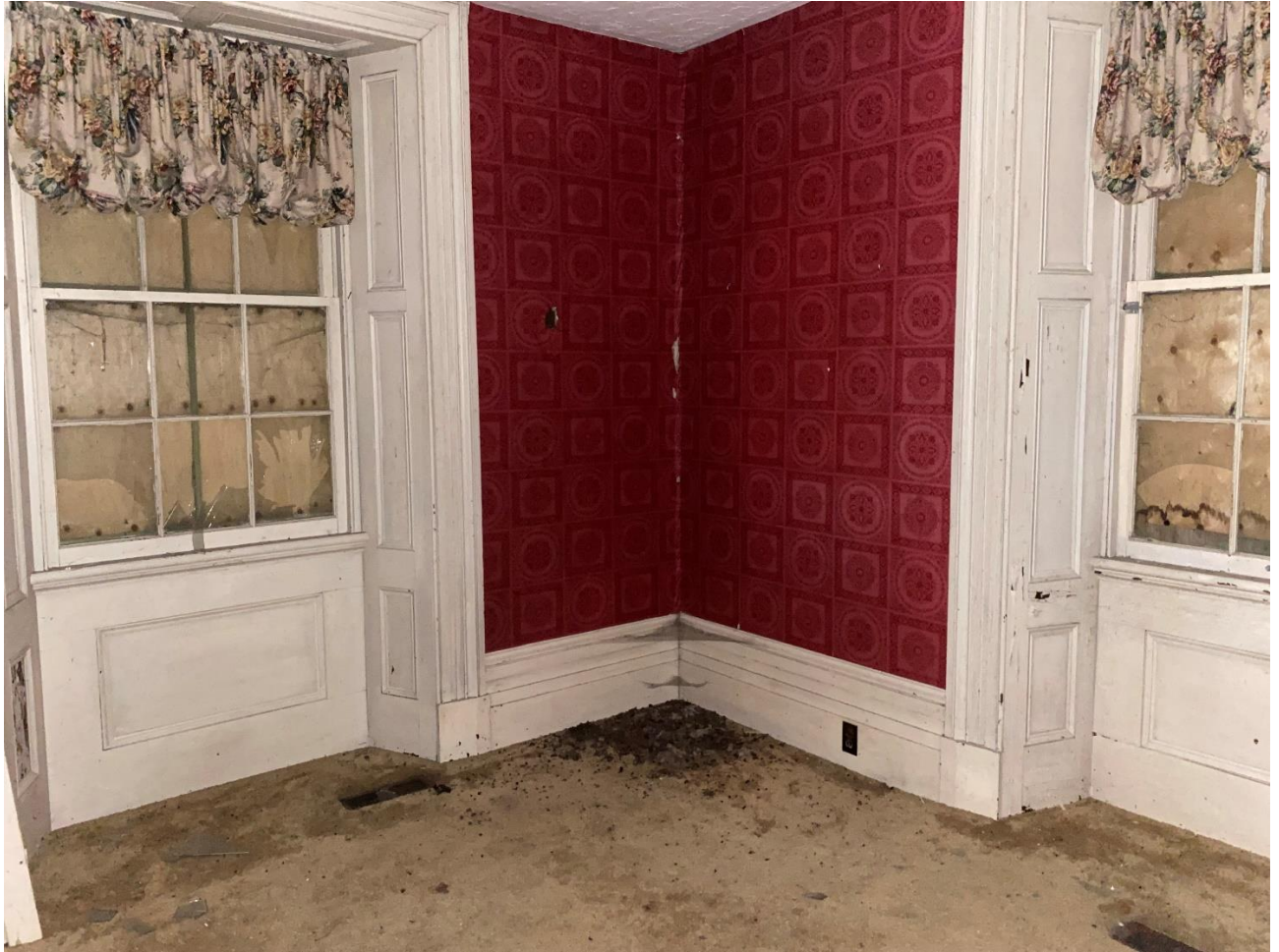
Figure 3: Parlour