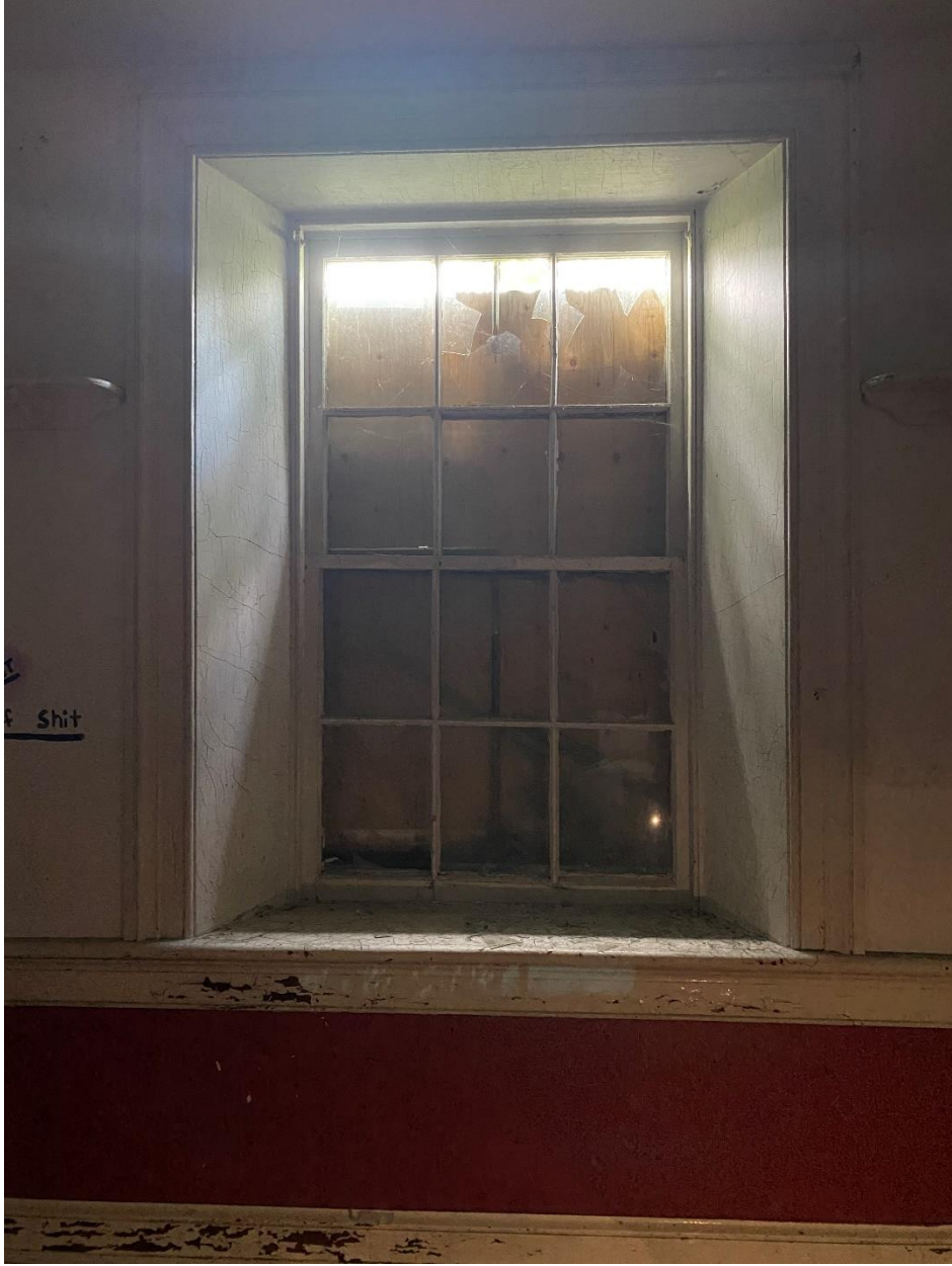
Figure 5: Dining room window