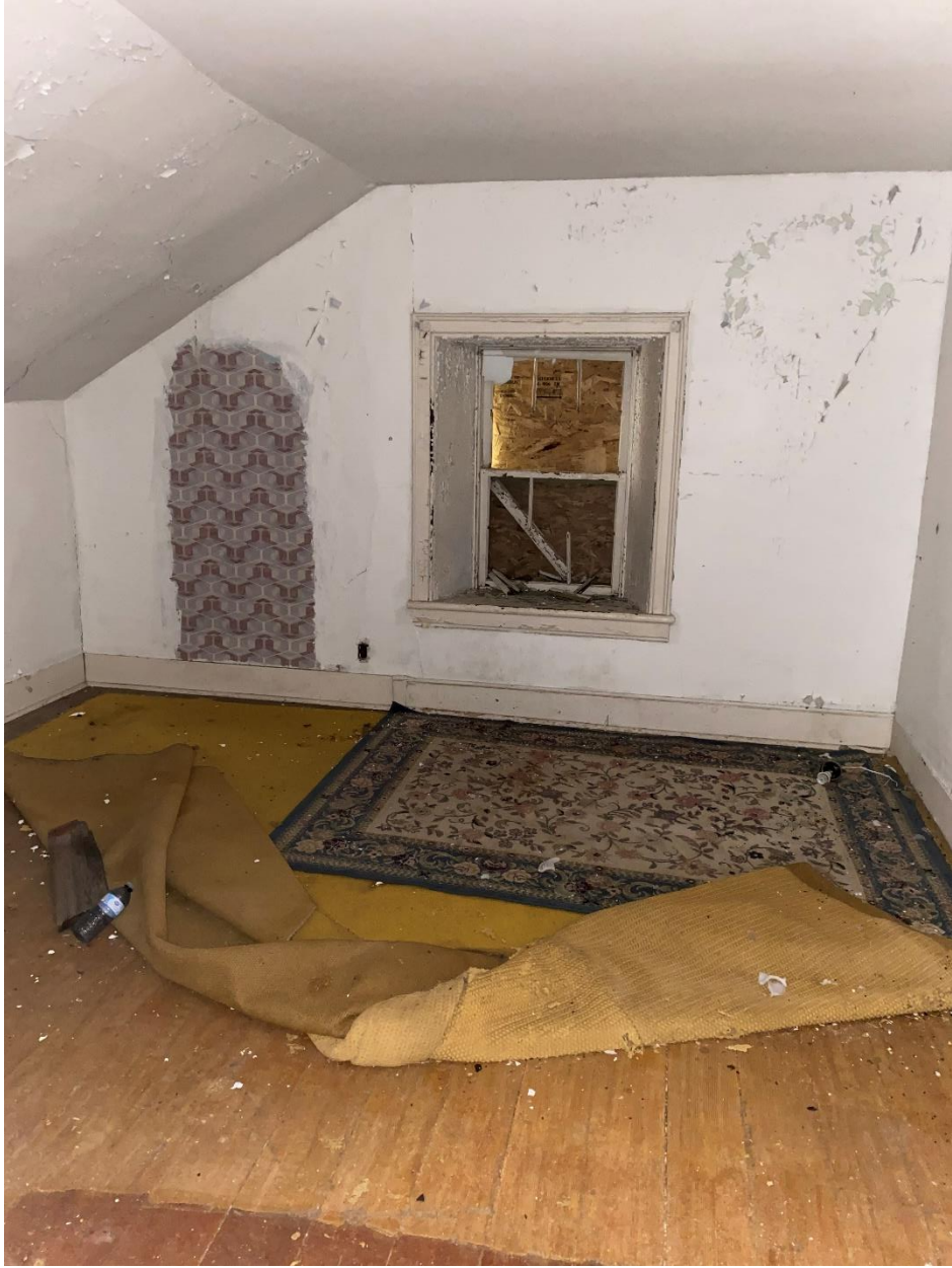
Figure 13: Upper floor bedroom