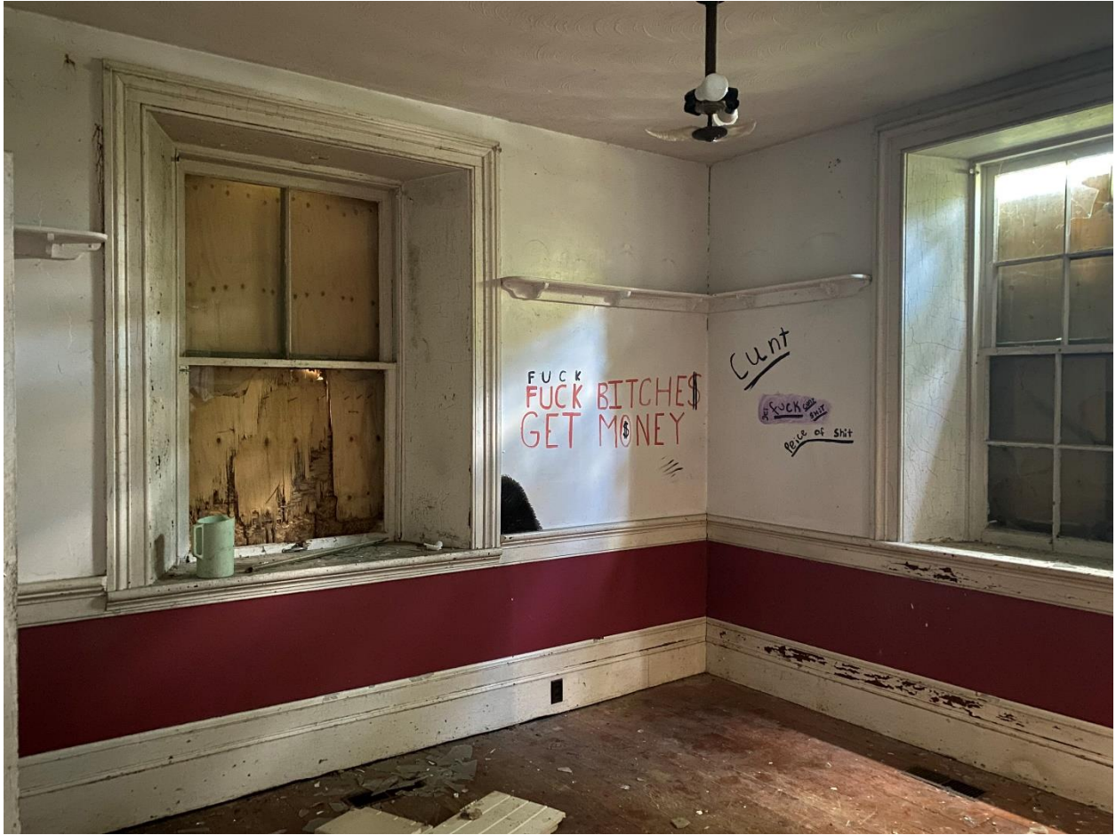
Figure 6: Dining Room