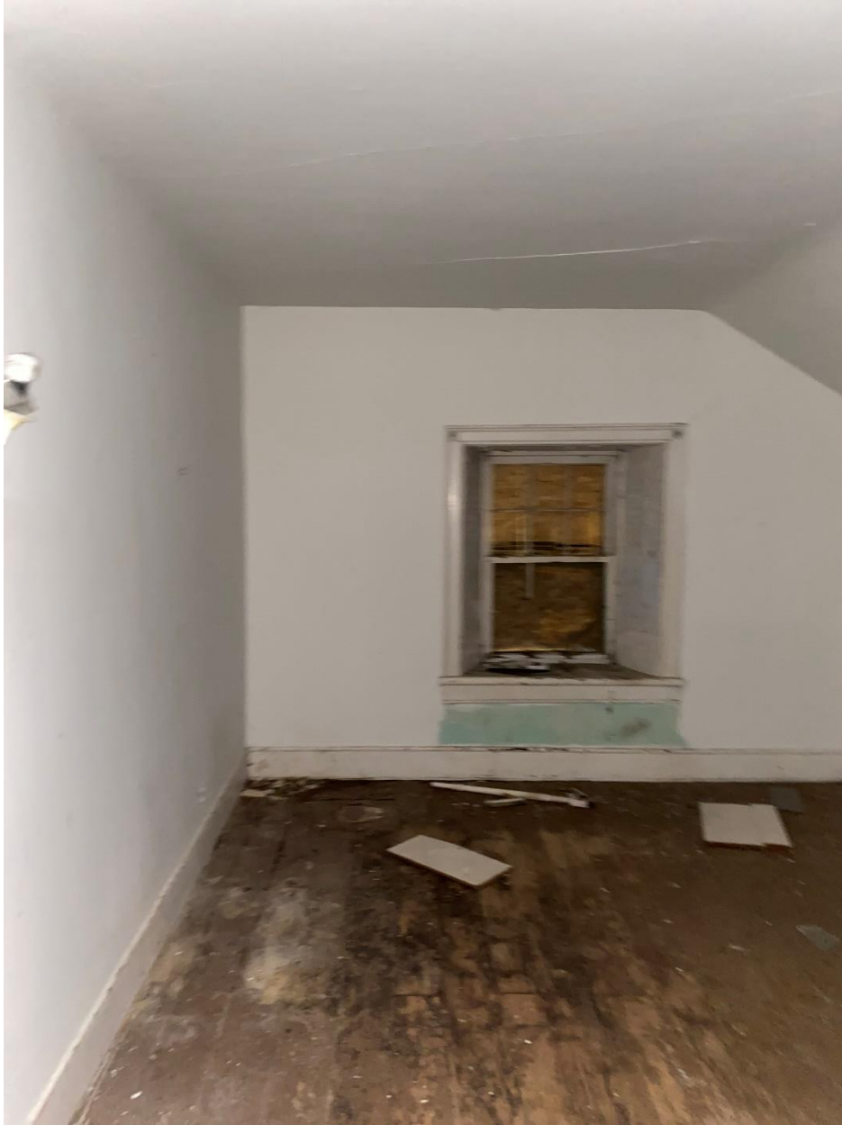
Figure 12: Upper floor bedroom