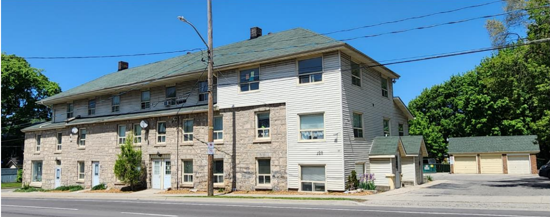
Figure 4: 220 Gordon St, view from south, 220 Gordon St