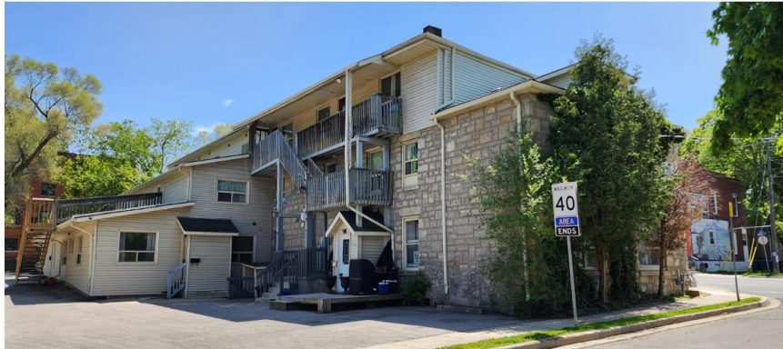
Figure 5: 220 Gordon St, rear of property from north