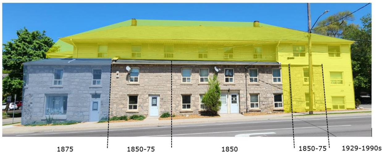
Figure 6 - Overlay on photo depicting the stages of construction.

The building we see today (Figure 6) evolved over time and can be divided chronologically into three sections: William Crowe's wagon factory and Thomas Oldham's knitting mill (c. 1850-1875); William Oldham's corner store with dwelling above (1875); and the additions creating a third floor in 1929 and the 1990s.