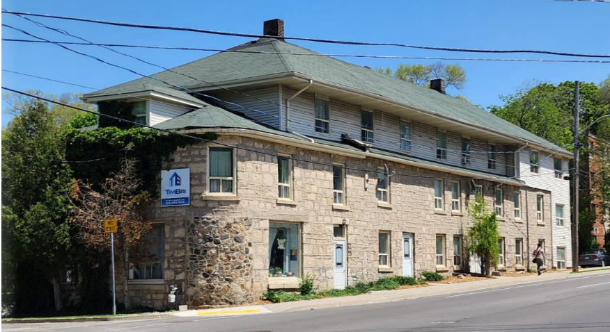
Figure 3 - 220 Gordon St, view from west.

The subject property includes: a 3-storey, apartment building on the corner (Figures 3, 4, 5); two semi-detached dwellings addressed as 9 and 11 James Street East (Attachment 1 - Figure 6); and a brick, 3-car garage in the southeast corner (Attachment 1 - Figure 7).