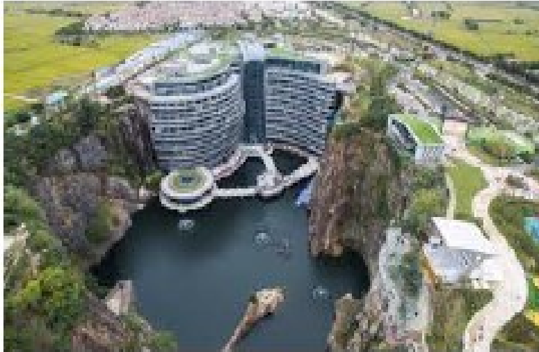
groundscaper' hotel ... stuff co nz