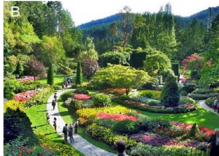
Figure 1: A) Site of the limestone quarry at Butchart Gardens. B) One of the main Butchart gardens in Spring