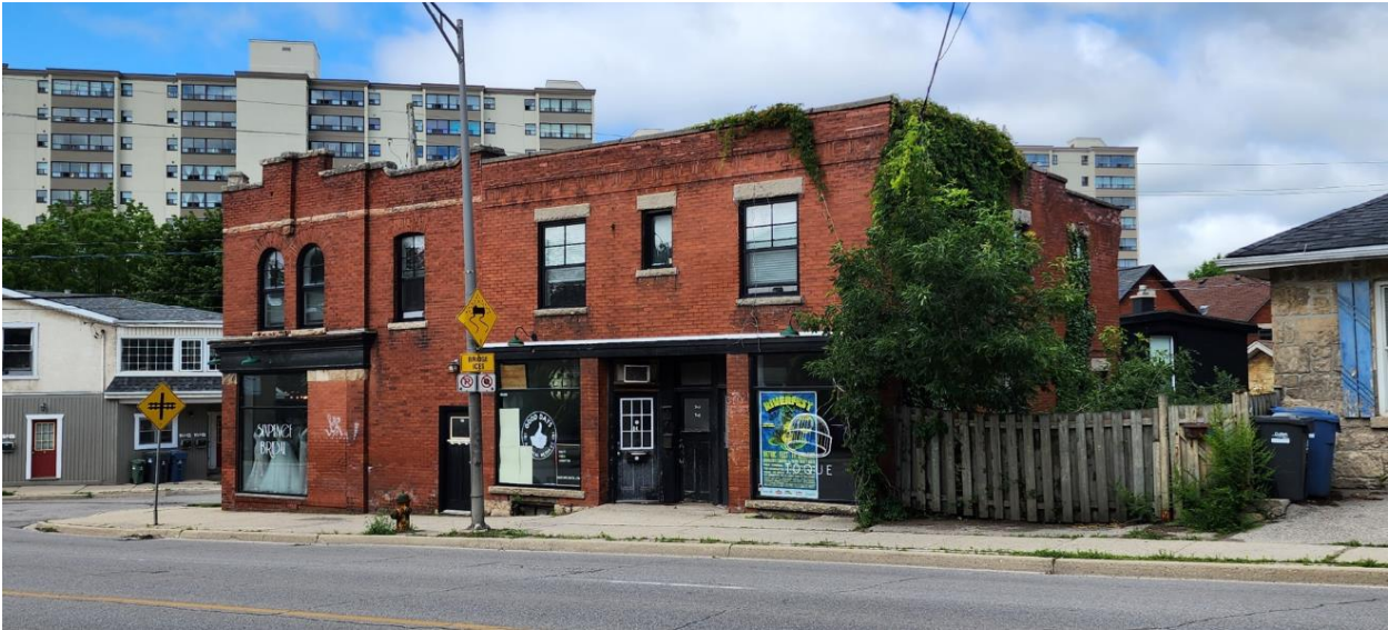
Figure 4 – 12-16 Eramosa Road, view from east.