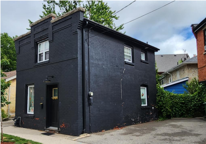
Figure 5: Stable building fronting Arthur St N.