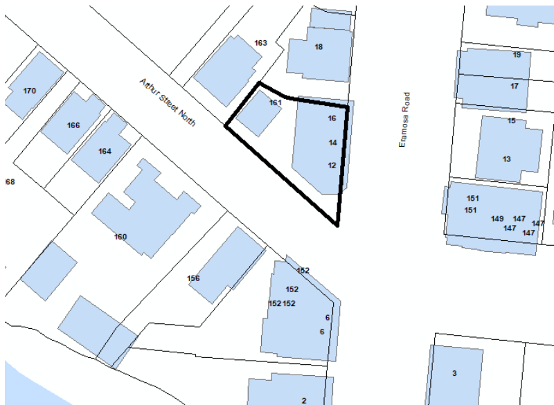
Figure 1: Location of 12 Eramosa Road. (City of Guelph GIS)