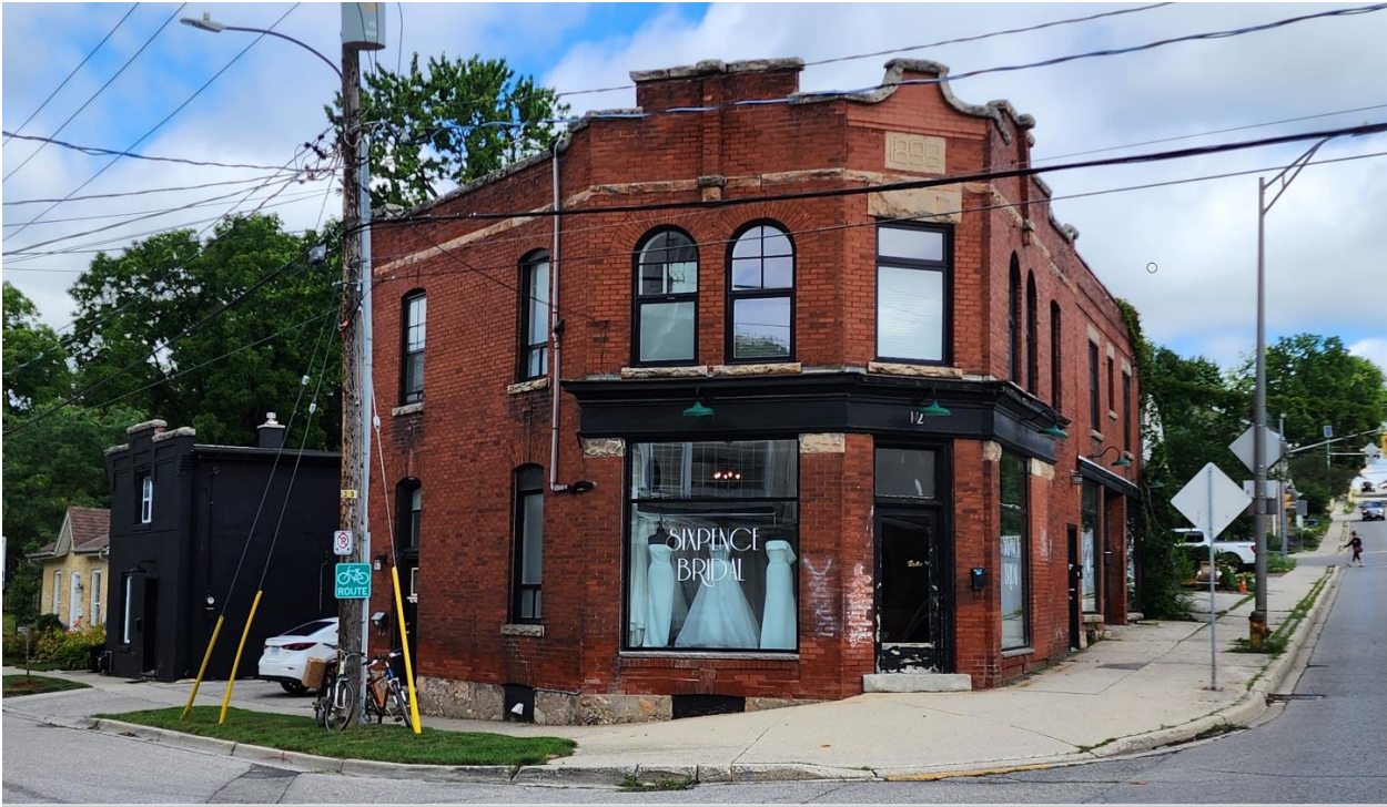
Figure 3 – 12 Eramosa Road, view from south.

The property includes a 2-storey, red brick, corner store building with residential units above (Figures 3 and 4) and a detached, 2-storey, red brick stable building (now painted black) fronting Arthur Street North (Figure 5).