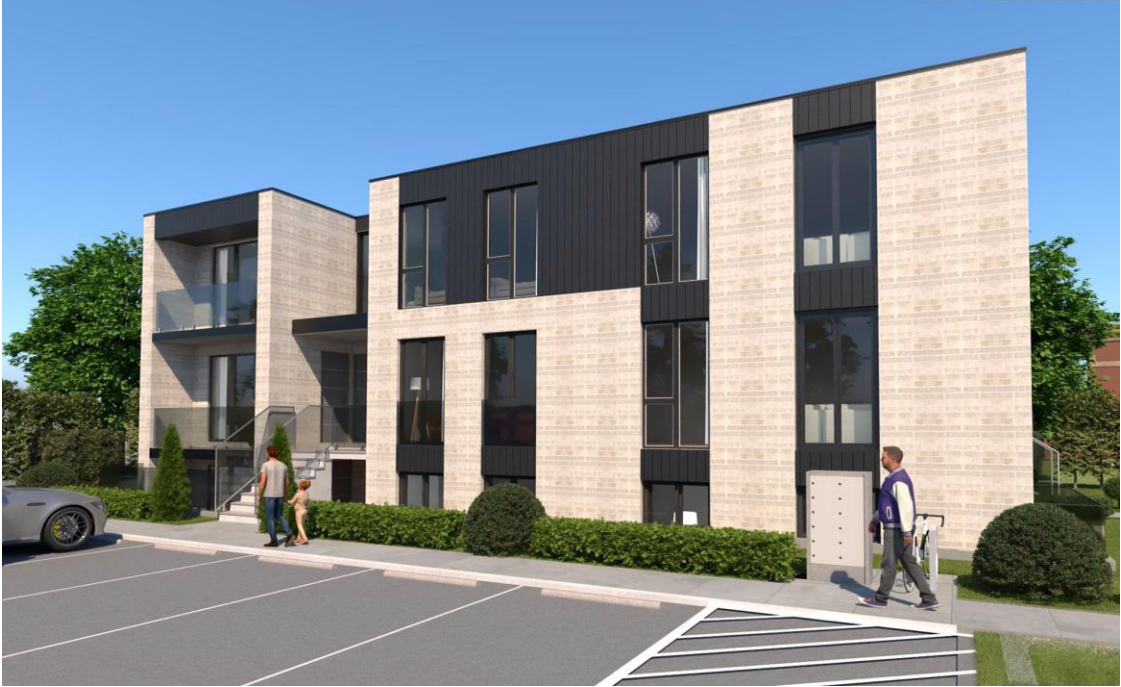
Figure 1: View of south elevation from the parking lot entrance.