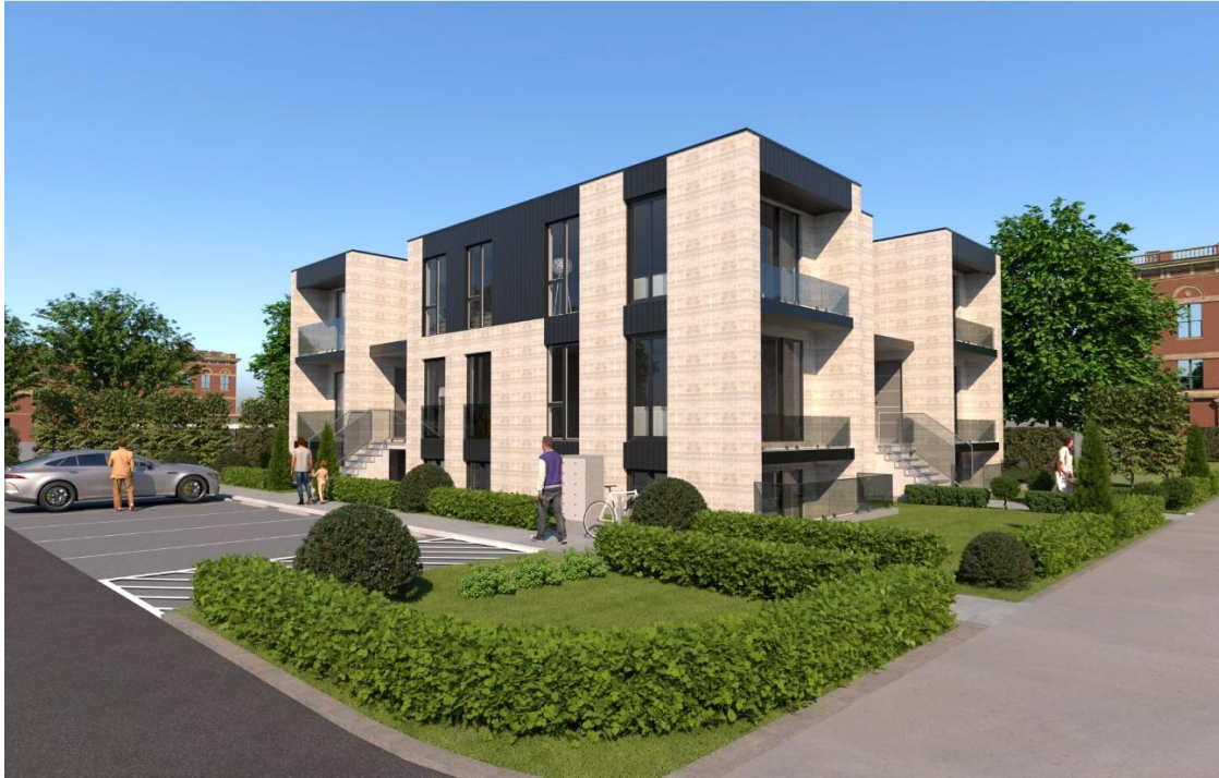
Figure 3: Southwest corner of the building viewed from Stevenson Street North