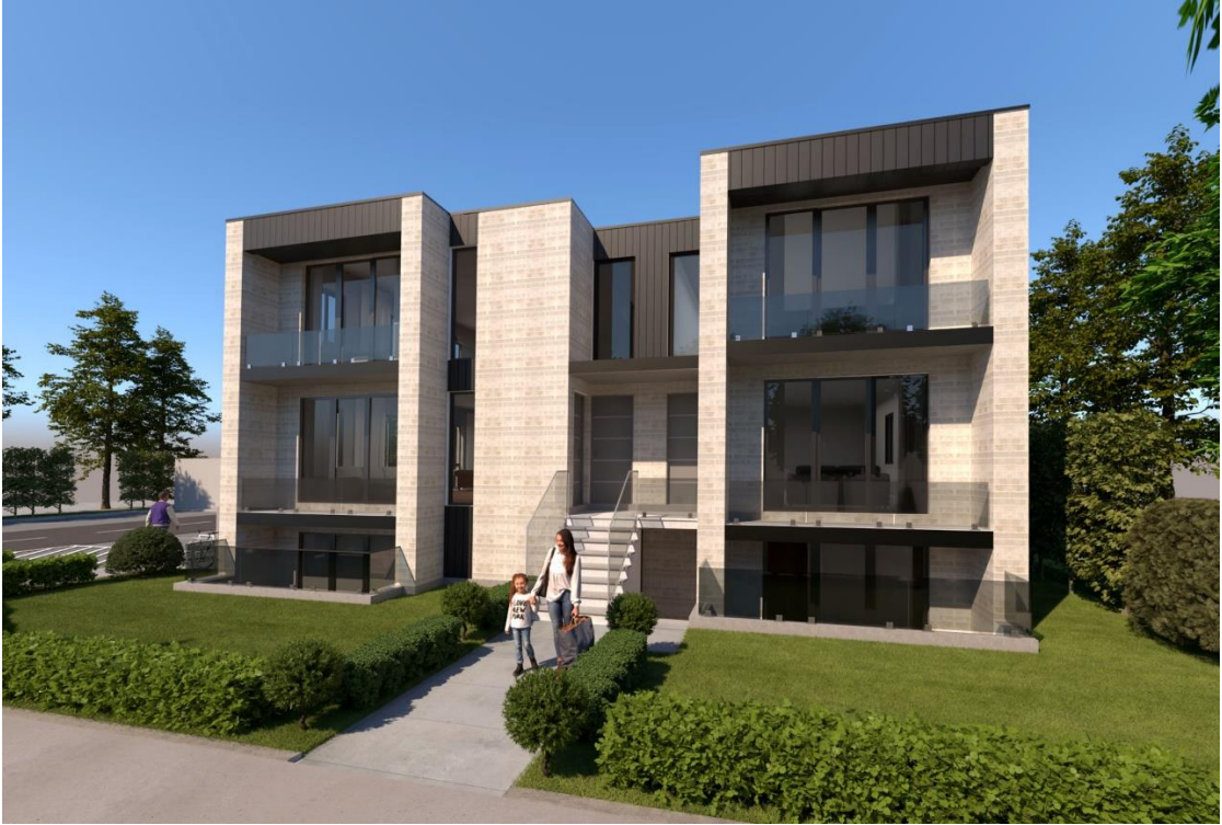
Figure 2: West elevation viewed from Stevenson Street North