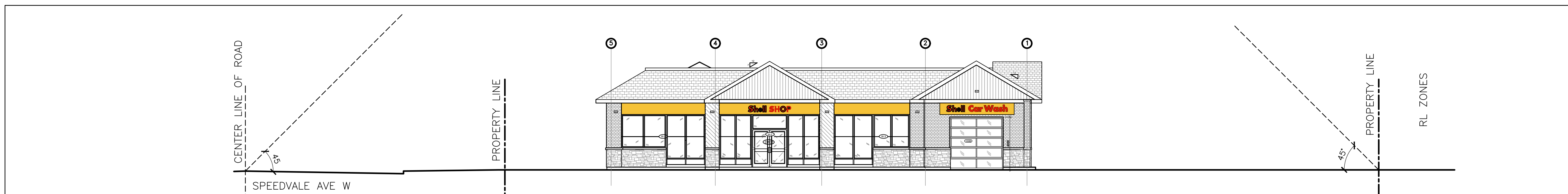
3 ANGULAR PLANE COMPLIANCE SOUTH-NORTH A-202 SCALE 1:125