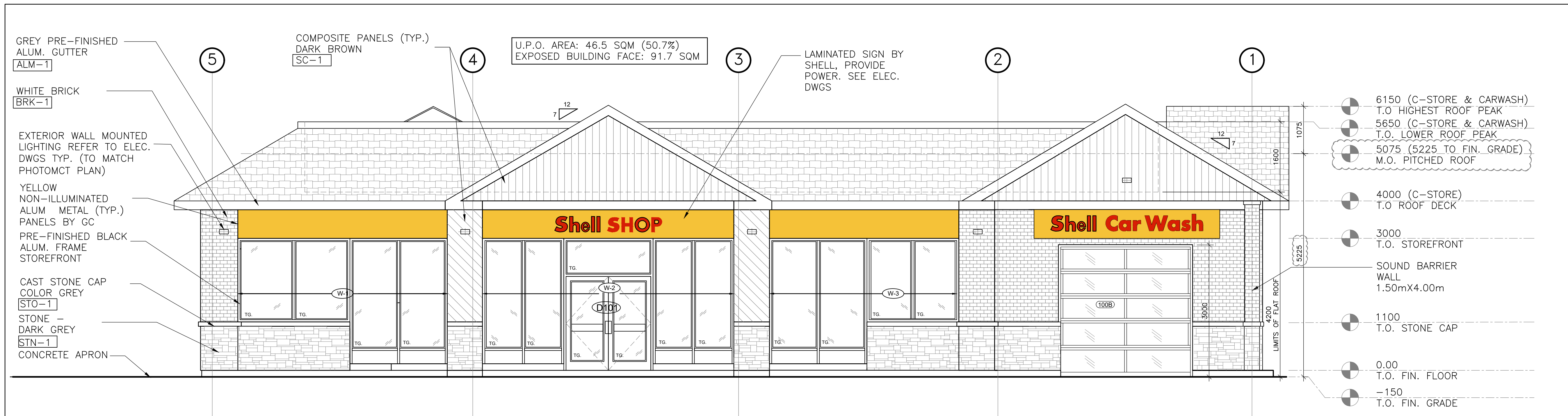
1 EAST ELEVATION A-202 SCALE 1:50