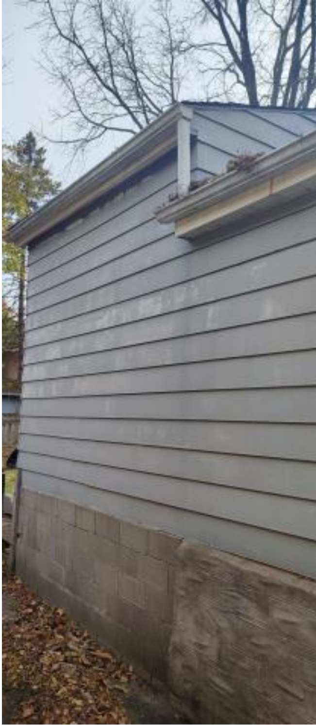
Figure 3: East elevation of the residential dwelling showing the addition proposed for removal (note cinder block foundation and raised roof)