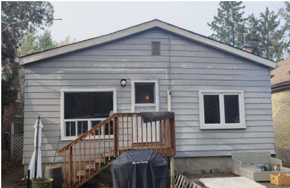
Figure 2: South (rear) elevation of the house showing the 1967 addition proposed for removal