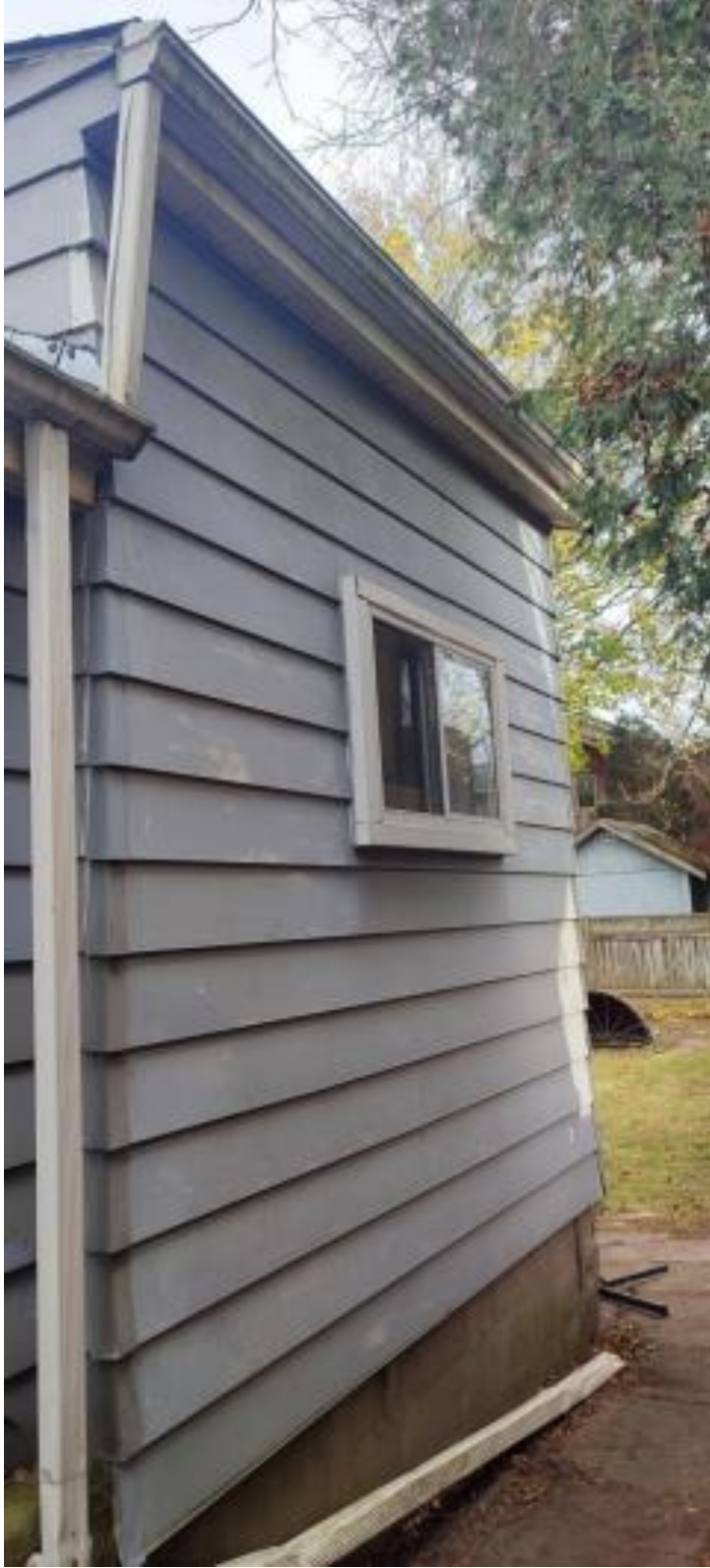
Figure 4: West elevation of the 1967 addition