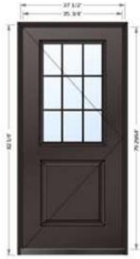
Figure 6: Proposed steel front door