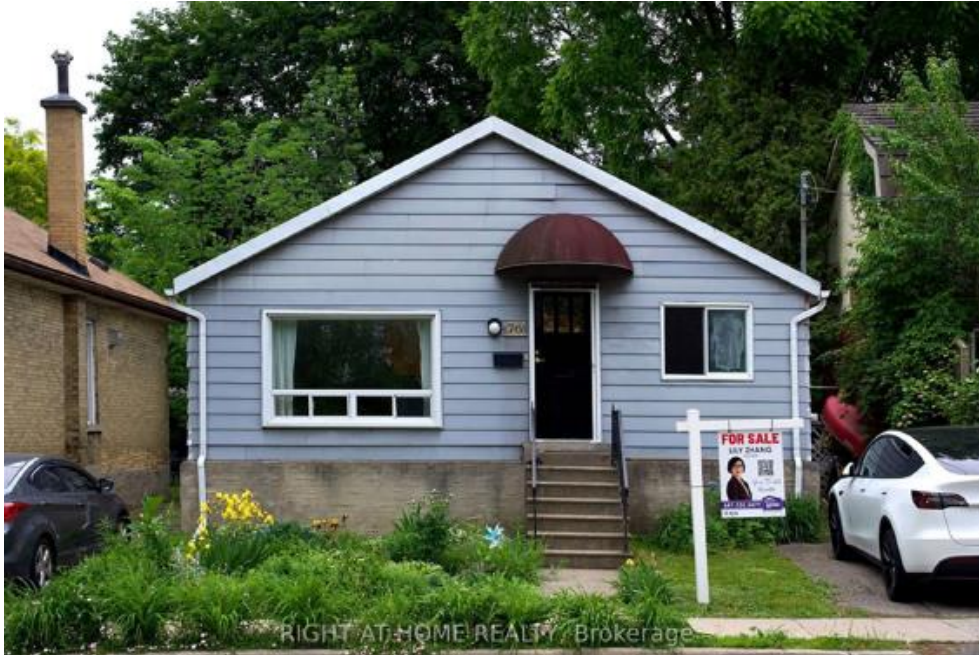
Figure 1: North Facade of the house facing Water Street. Large window to be enlarged and replaced, door to be replaced, and small window beside door to be replaced.