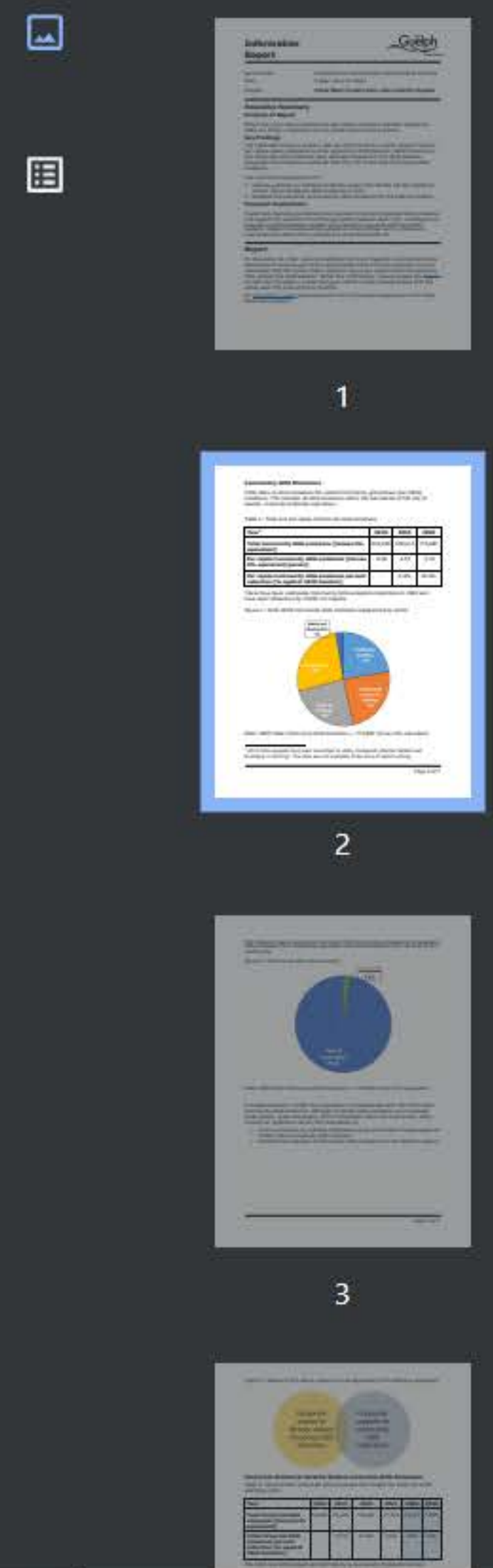
Table 1: Total and per capita Community GHG emissions