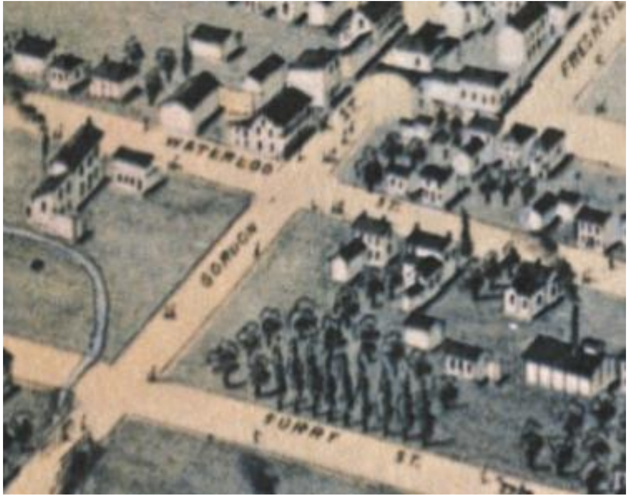
Figure 7: Brosius' 1872 Birdseye Map of Guelph, showing buildings on the lots that now contain 15-23 Fountain St E