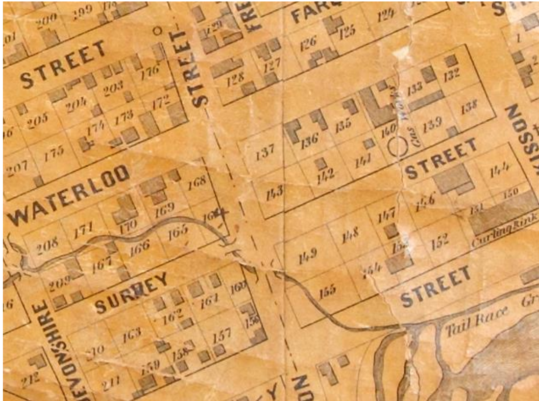
Figure 6: Lot 136 as seen in Cooper's Map c. 1875