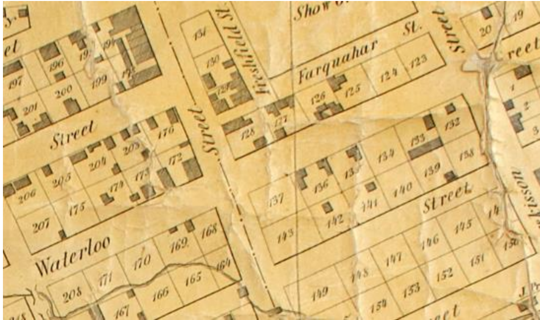
Figure 5: Lot 136 as seen in Cooper's Map c. 1862.