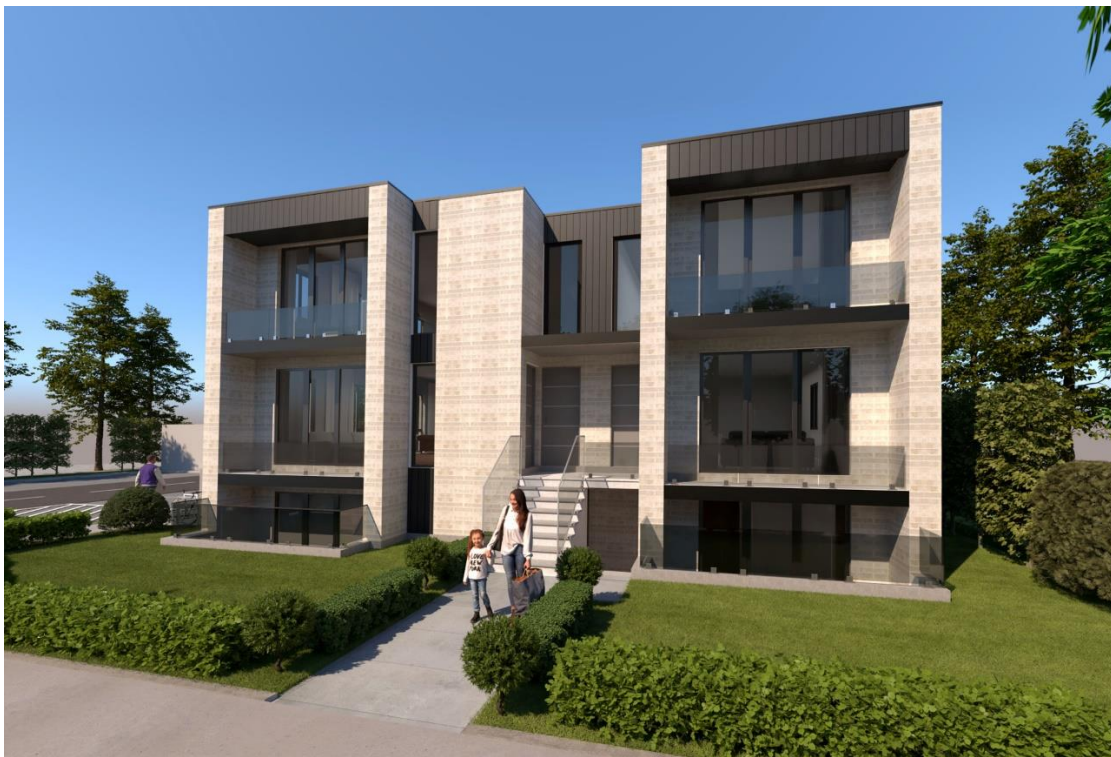
Figure 2: West elevation viewed from Stevenson Street North