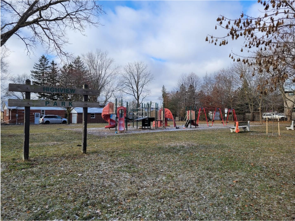
Figure 2: Highview Park existing conditions

Below are images showing the existing conditions for each park.