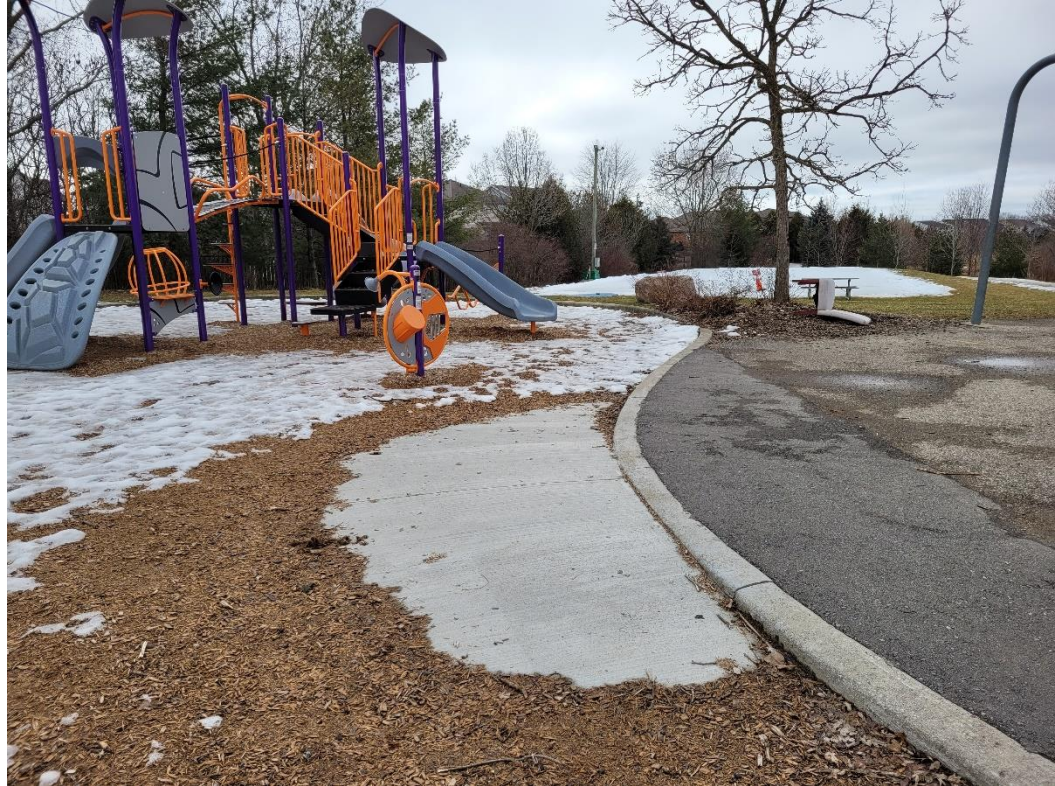
Figure 5: Example of an accessible ramp into a play space