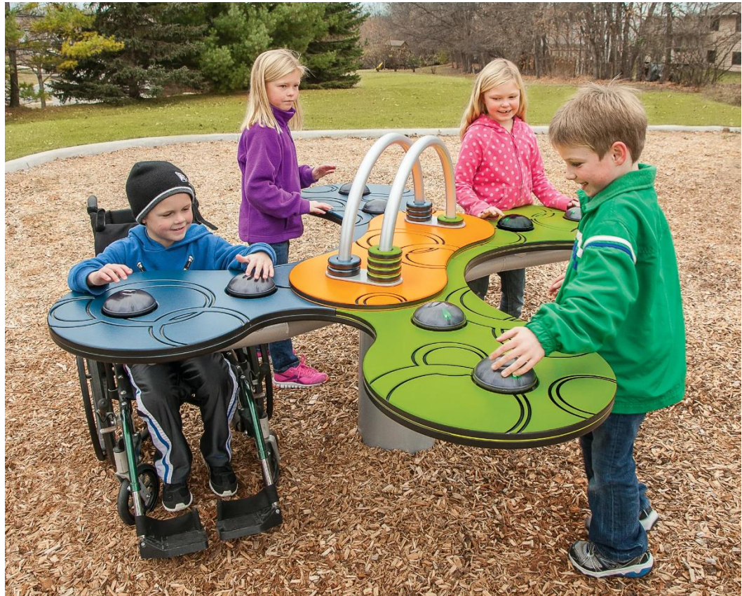
Figure 6: Example of an accessible and inclusive playground element