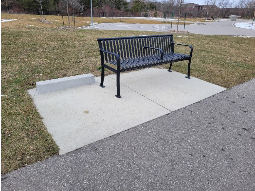
Figure 7: Example of an accessible bench