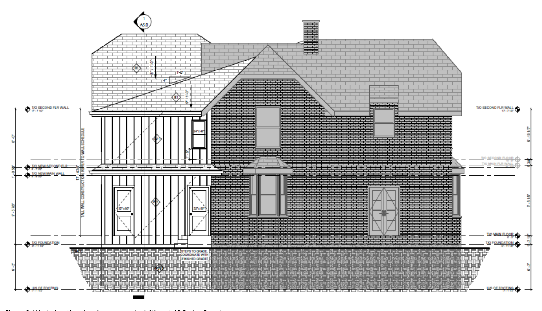
Figure 3: West elevation showing proposed addition at 40 Spring Street