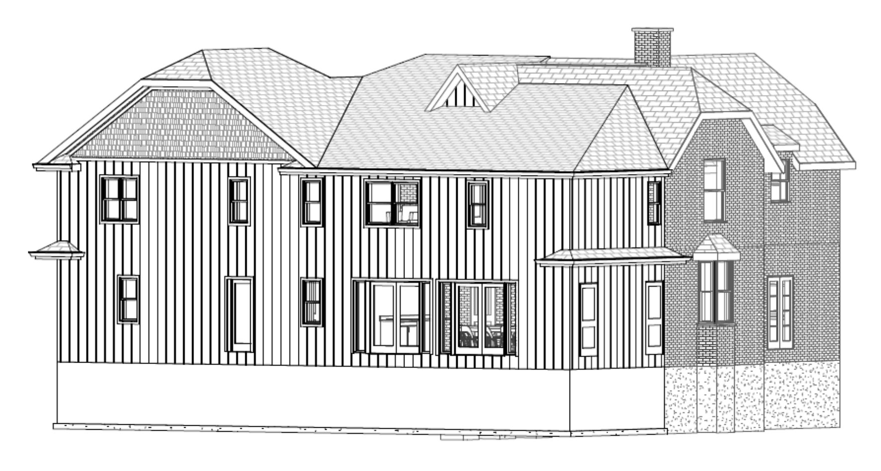
Figure 5: Rendering of proposed addition at 40 Spring Street viewed from the rear yard