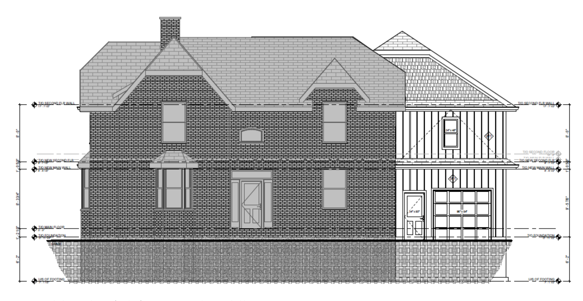
Figure 4: South elevation showing facade of 40 Spring Street and proposed addition