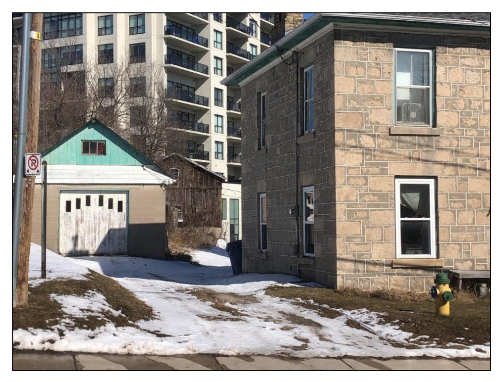
Figure 4 Photo 14 Neeve Street driveway, garage, barn, and stone house.

Figure 3: Photo of 14 Neeve Street garage. Stone walls, vinyl fascia, and a small window below the peak of a shingle roof.