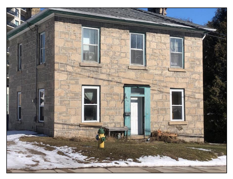
Figure 5 Photo of 14 Neeve taken from opposite side of Neeve Street.