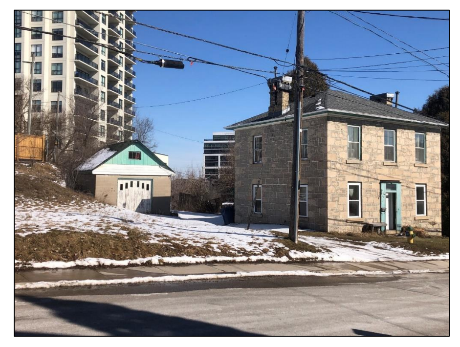
Figure 2: Neeve Street stone house and garage taken from corner of Neeve and Fountain Street.

Figure 1: 14 Neeve Street stone house and garage taken from corner of Neeve and Fountain Street.