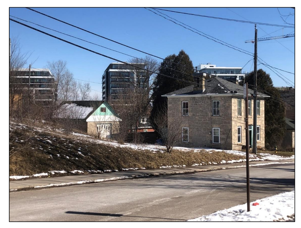
Figure 1: 14 Neeve Street stone house and garage taken from corner of Neeve and Fountain Street.

*All photos were taken on February 20<sup>th</sup> by Robert Flewelling, Heritage Research Assistant.