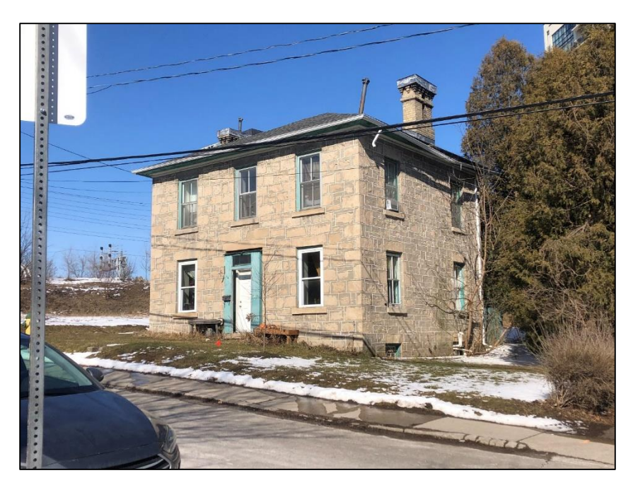
Figure 7: Photo of 14 Neeve Street Neeve Street.