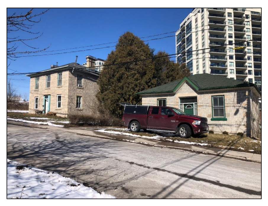
Figure 9: 14 Neeve Street and neighboring stone house, likely built around the same time.

Figure 9: Photo of Neeve Street barn, laneway, and red brick house on Surrey (that was built by Francis Law, the original owner of 14 Neeve Street).