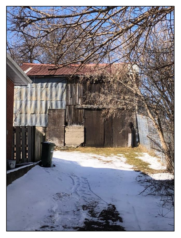
Figure 8: Photo of 14 Neeve barn taken from driveway on Surrey Street. Mixed materials for siding with red/rusting tin roof. Large sliding door on right side.