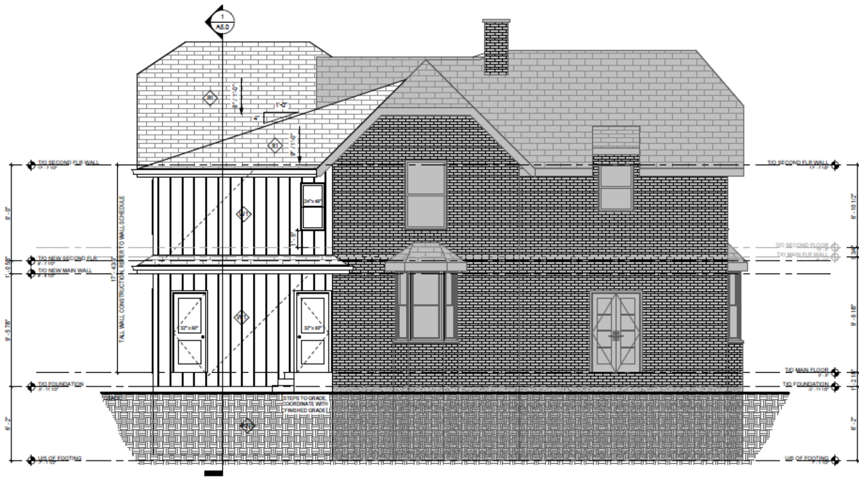
Figure 3: West elevation showing proposed addition at 40 Spring Street