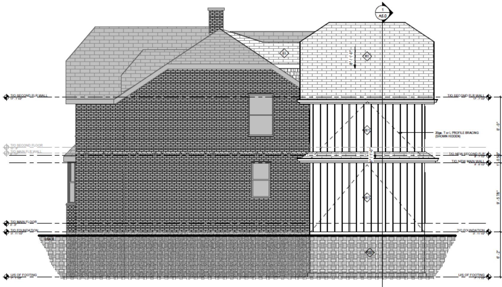
Figure 2: East elevation showing proposed addition at 40 Spring Street