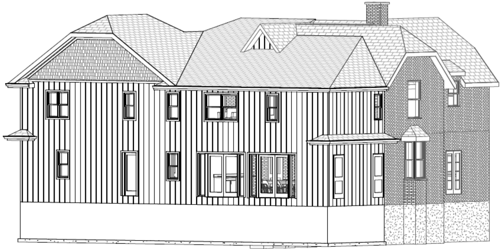
Figure 5: Rendering of proposed addition at 40 Spring Street viewed from the rear yard