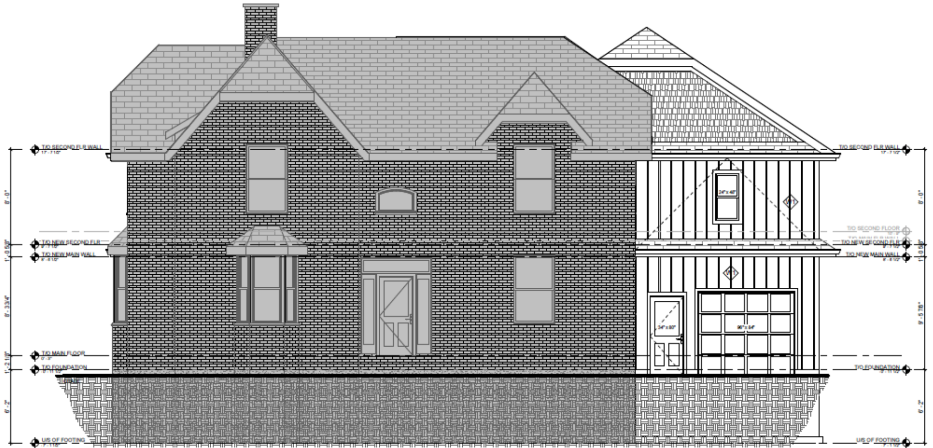
Figure 4: South elevation showing facade of 40 Spring Street and proposed addition