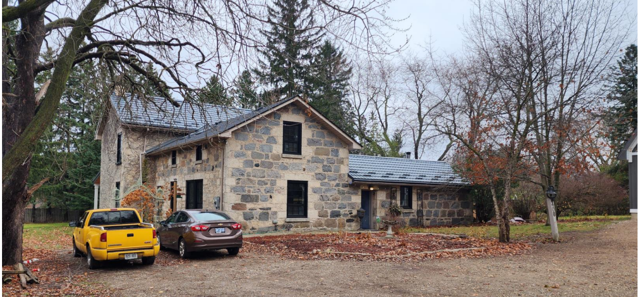
Figure 4 - View of original front of house (now at rear).