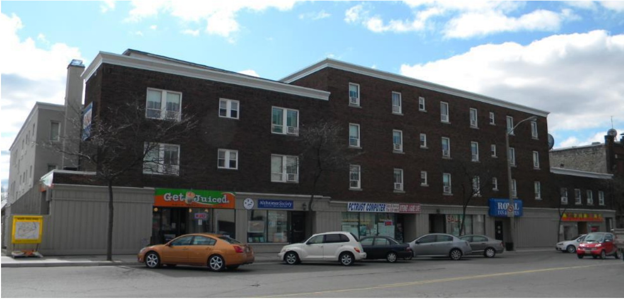
Figure 6 - View of Carden Street streetwall from railway track.