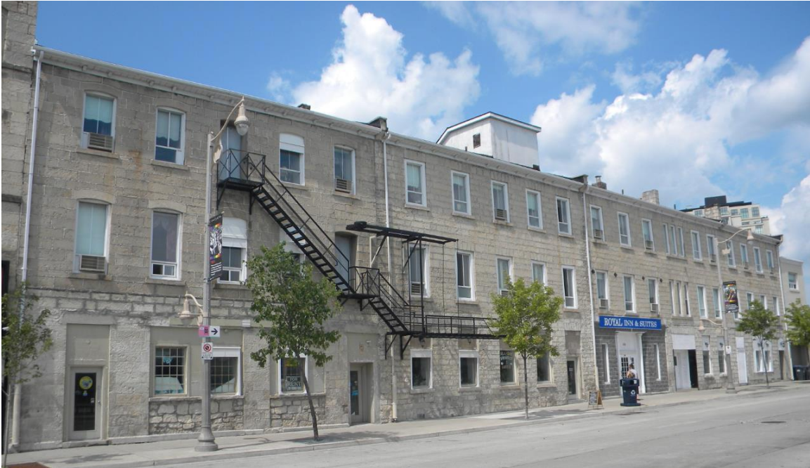
Figure 4 - 106 Carden Street from east.