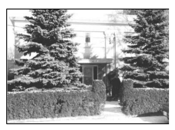
Figure 3: Gordon Couling Inventory Photograph, 1974