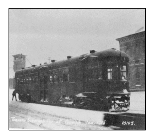
Figure 2 TSR car #105 in front of old City Hall, Carden Street, January 1918.