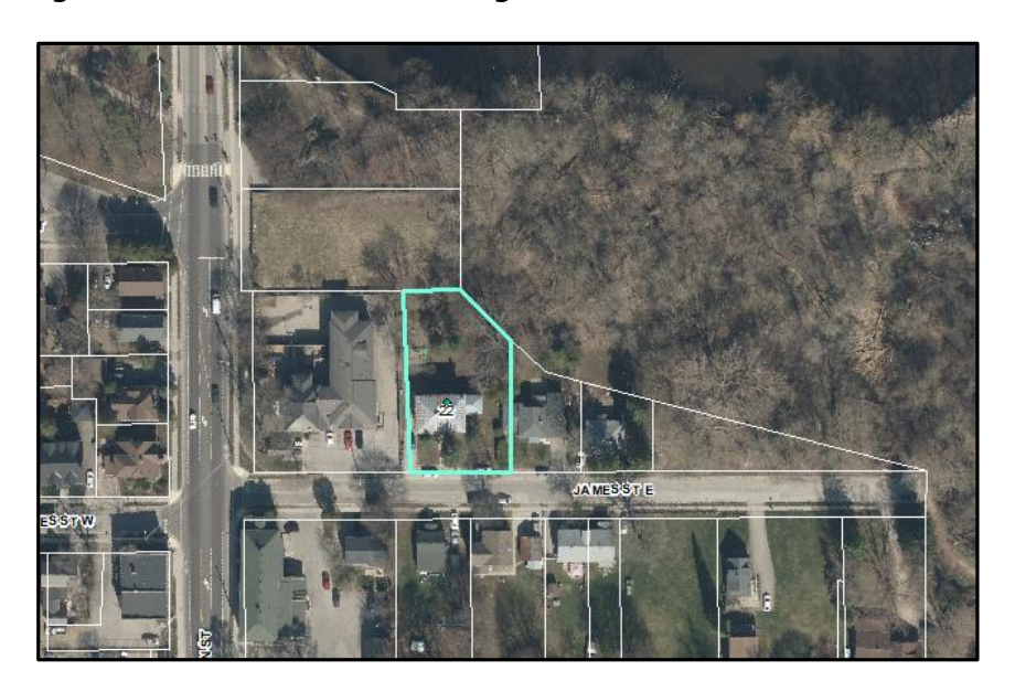
Figure 1: Current view of neighbourhood around 22 James Street East.