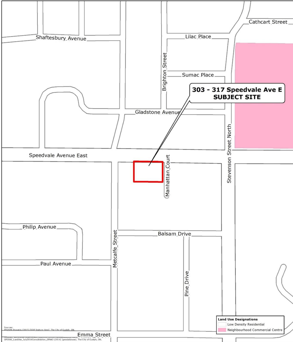
Figure 1: 303-317 Speedvale Avenue E.